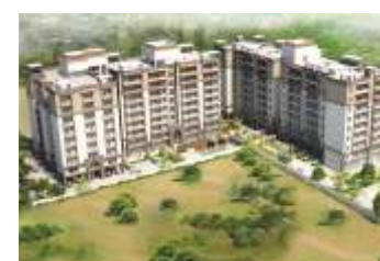
Orchid @ on main 300 ft. jaipur-ajmer expressway, jaipur