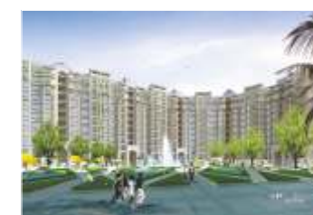
Harmony @ on main 300 ft. jaipur-ajmer expressway, jaipur