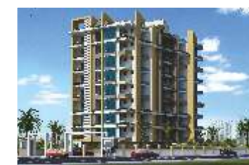
UDB Legend @ near collectorate, banipark, jaipur