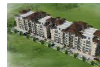
ecoscape @ patrakar colony, mansarovar, Jaipur