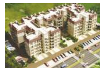
Celebrations @ near chokhi dhani, main tonk road, jaipur