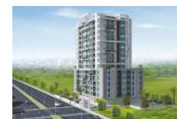
Indus @ near kisan dharam kanta, mansarovar, jaipur