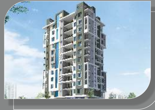
UDB Skyway - 1

@ opp. bhawani niketan, main sikar road, jaipur