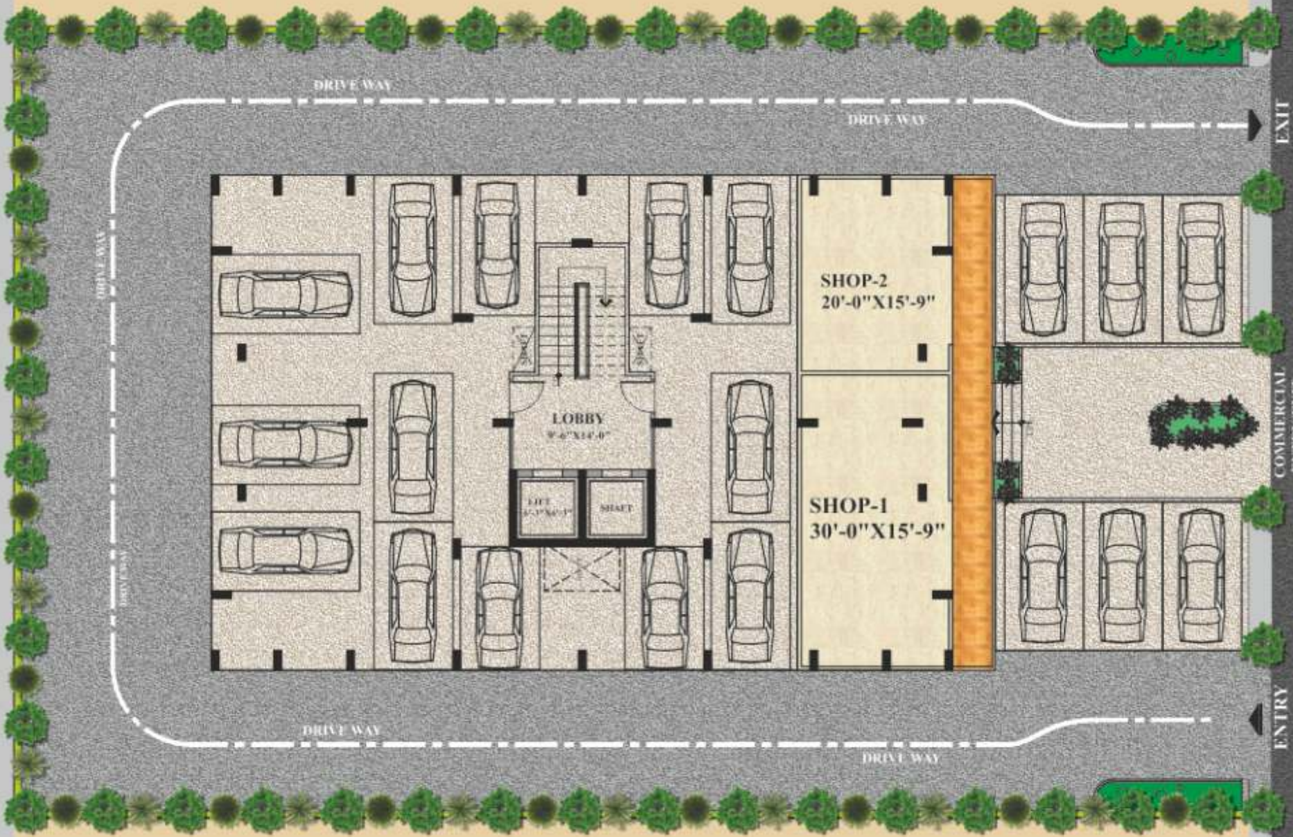
Stilt Floor Plan