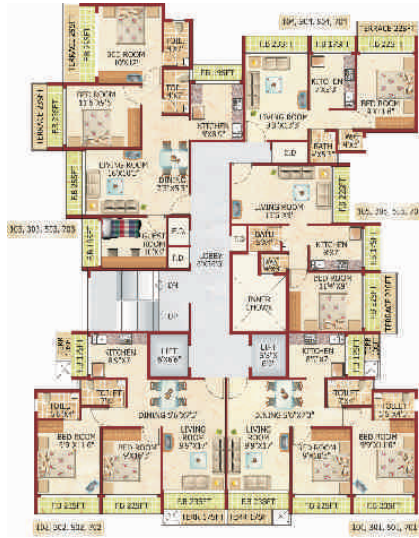
N TYPICAL FLOOR PLAN 1ST, 3RD, 5TH & 7TH