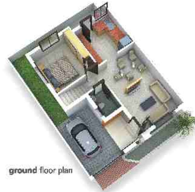
ground floor plan