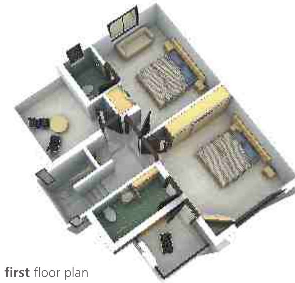
first floor plan