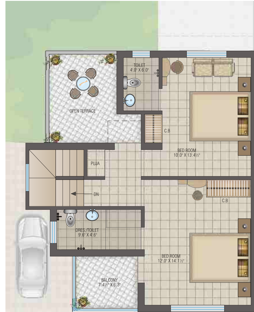
first floor plan