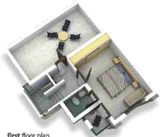
first floor plan