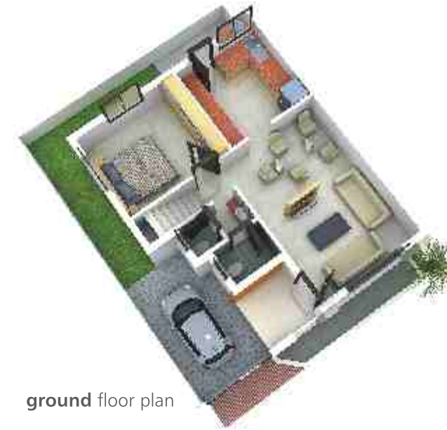
ground floor plan