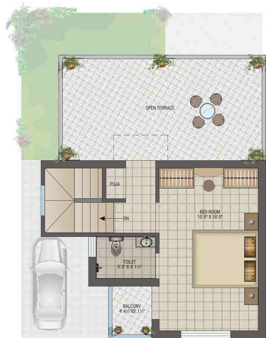
first floor plan