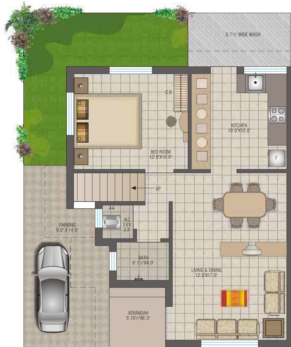
ground floor plan