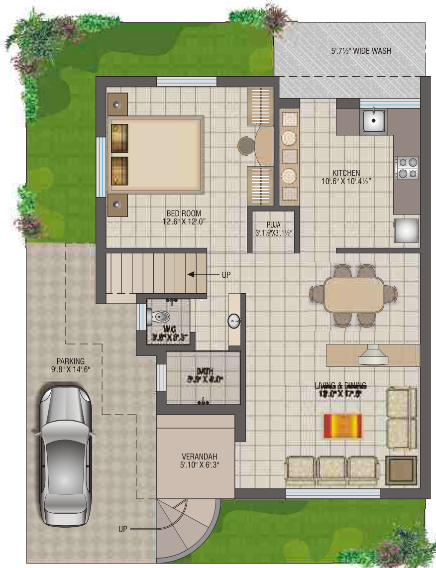
ground floor plan

TYPICAL : Plot Area-1192 Sq.Ft. Built Up -1456 Sq.Ft. (Approx)