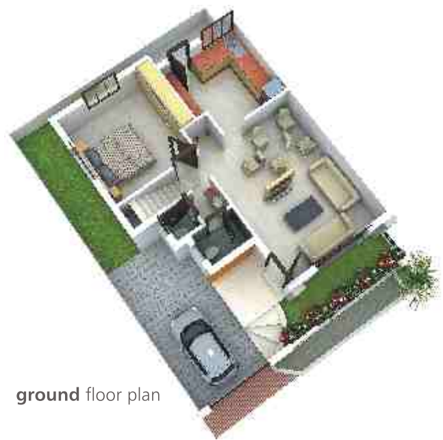
ground floor plan