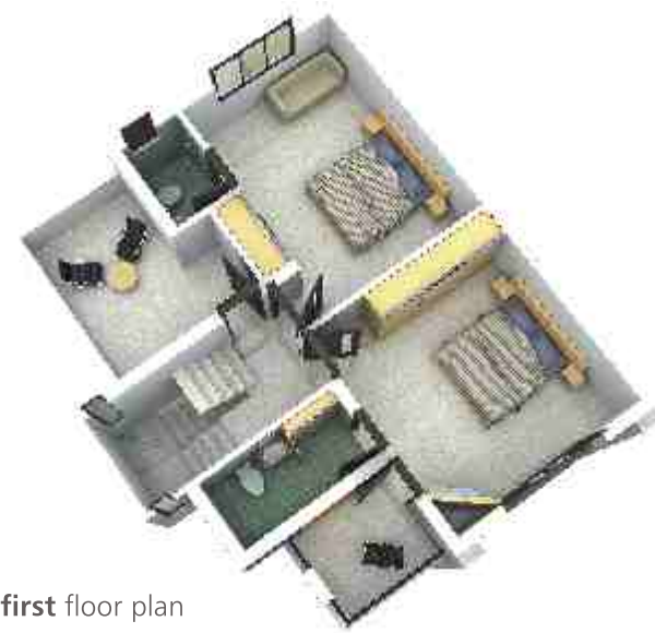
first floor plan