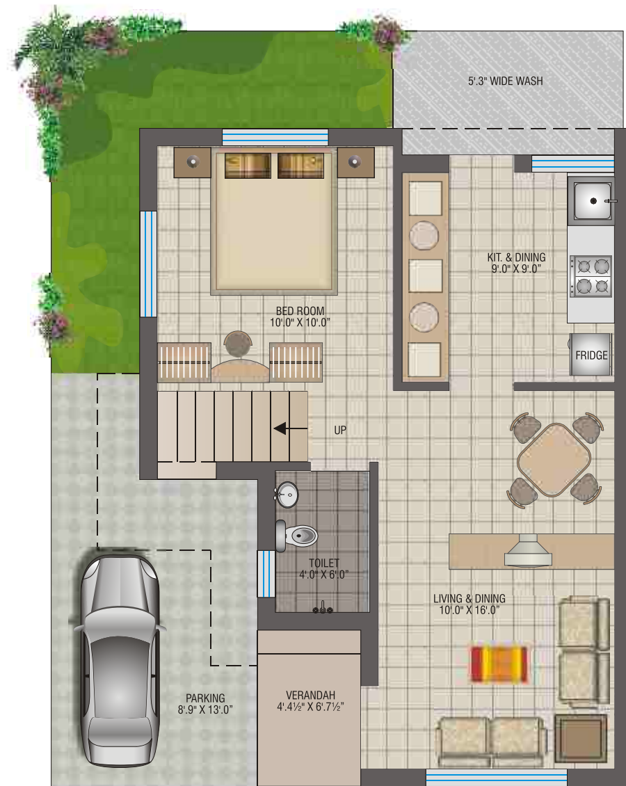
ground floor plan