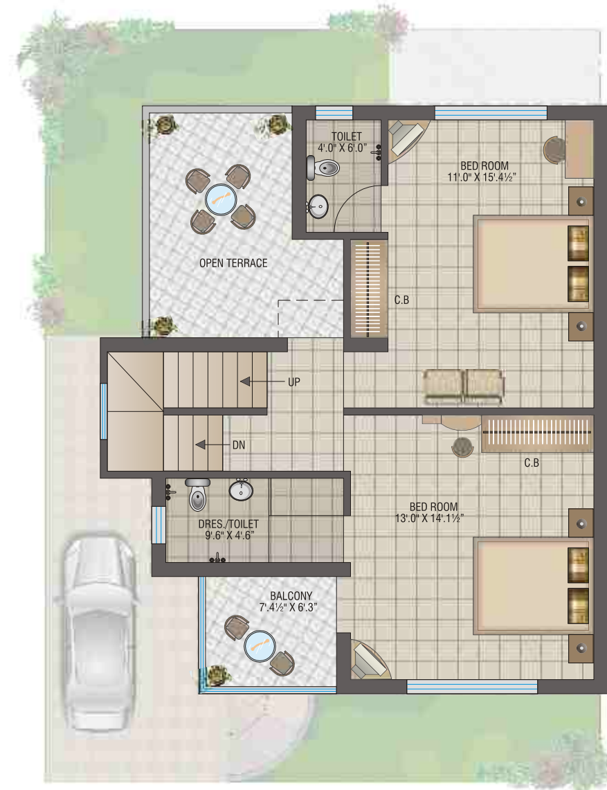
first floor plan