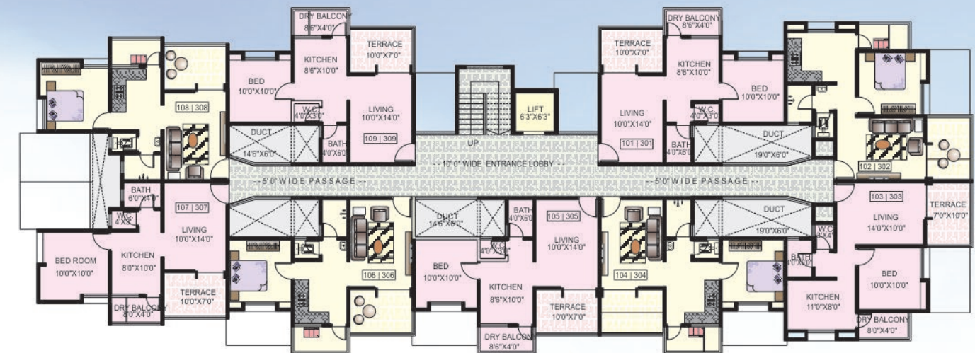
1 st & 3 rd FLOOR