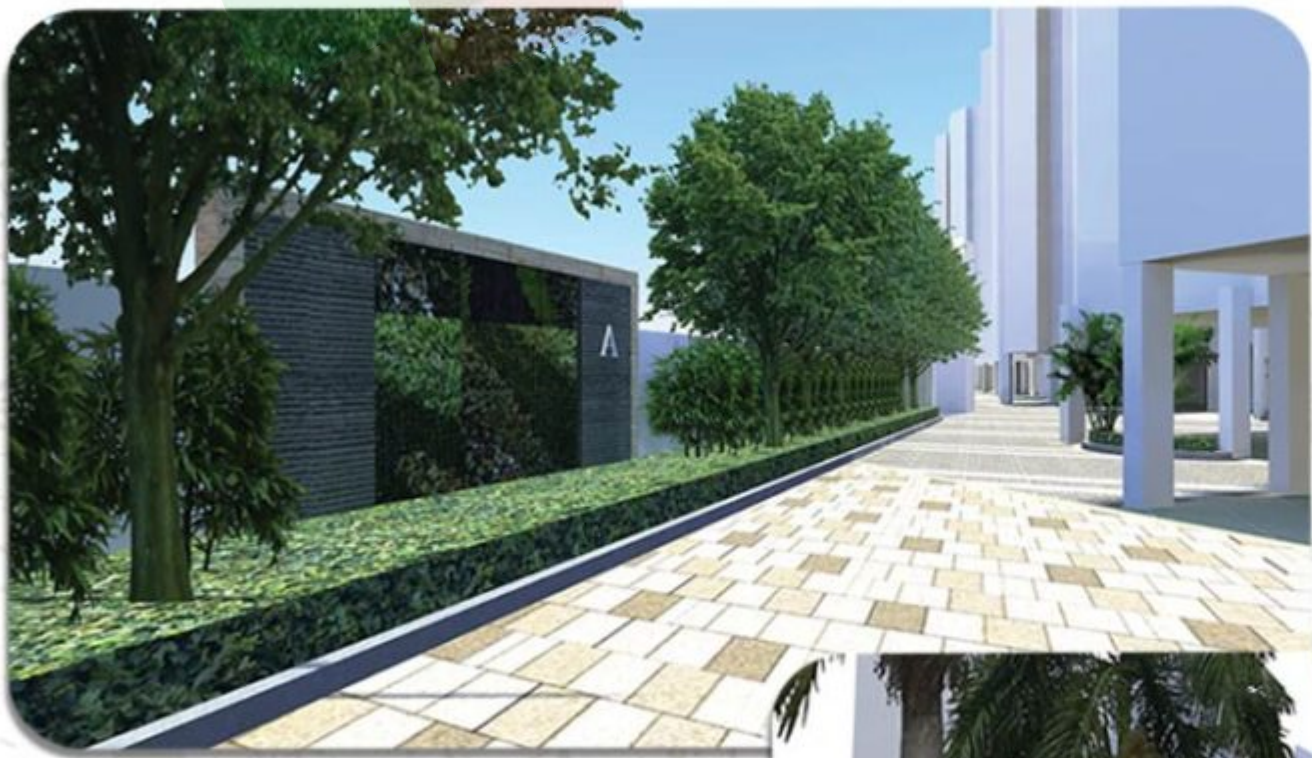
VIEW OF FEATURE WALL FROM DROP OFF AREA