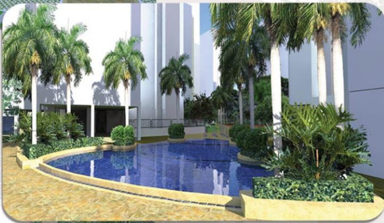
VIEW OF SWIMMING POOL FROM LAWN