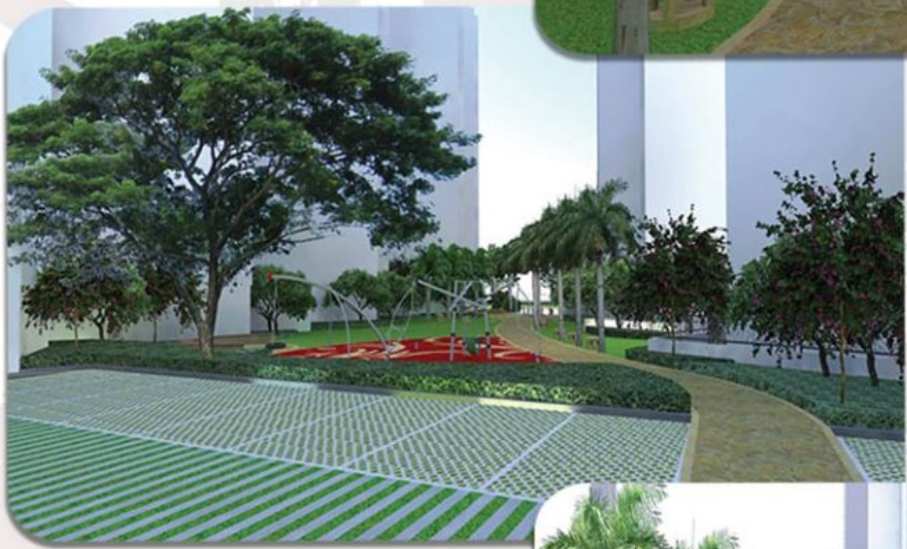
VIEW OF PLAY AREA AND PLAY LAWN