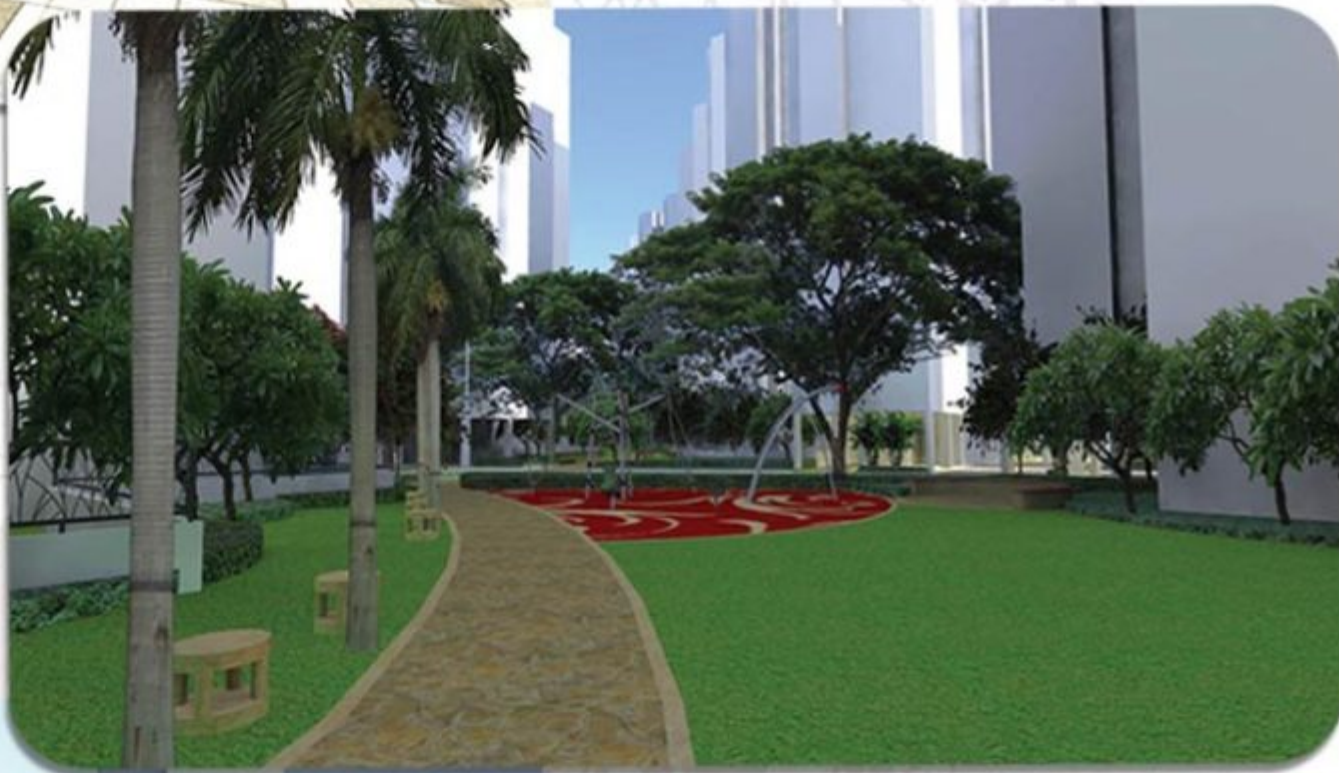
VIEW OF PARKING AND PLAY AREA