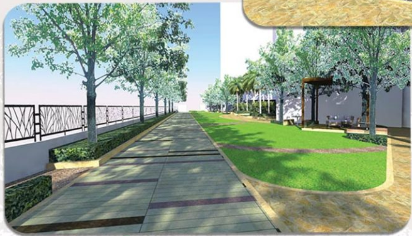
VIEW OF PROMENADE AND LAWN - 1