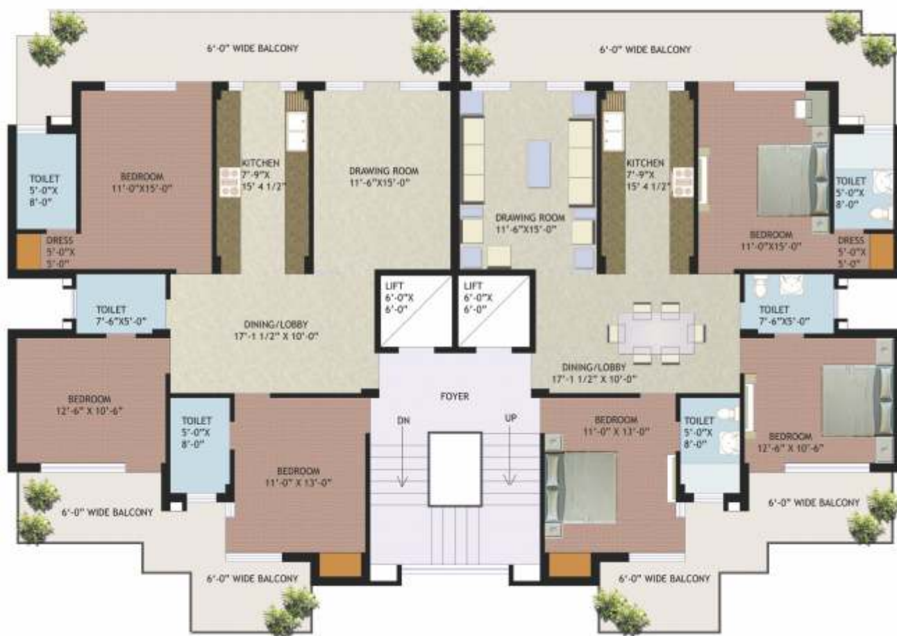
FLOOR PLAN OF 3BHK GIRISA TOWER II