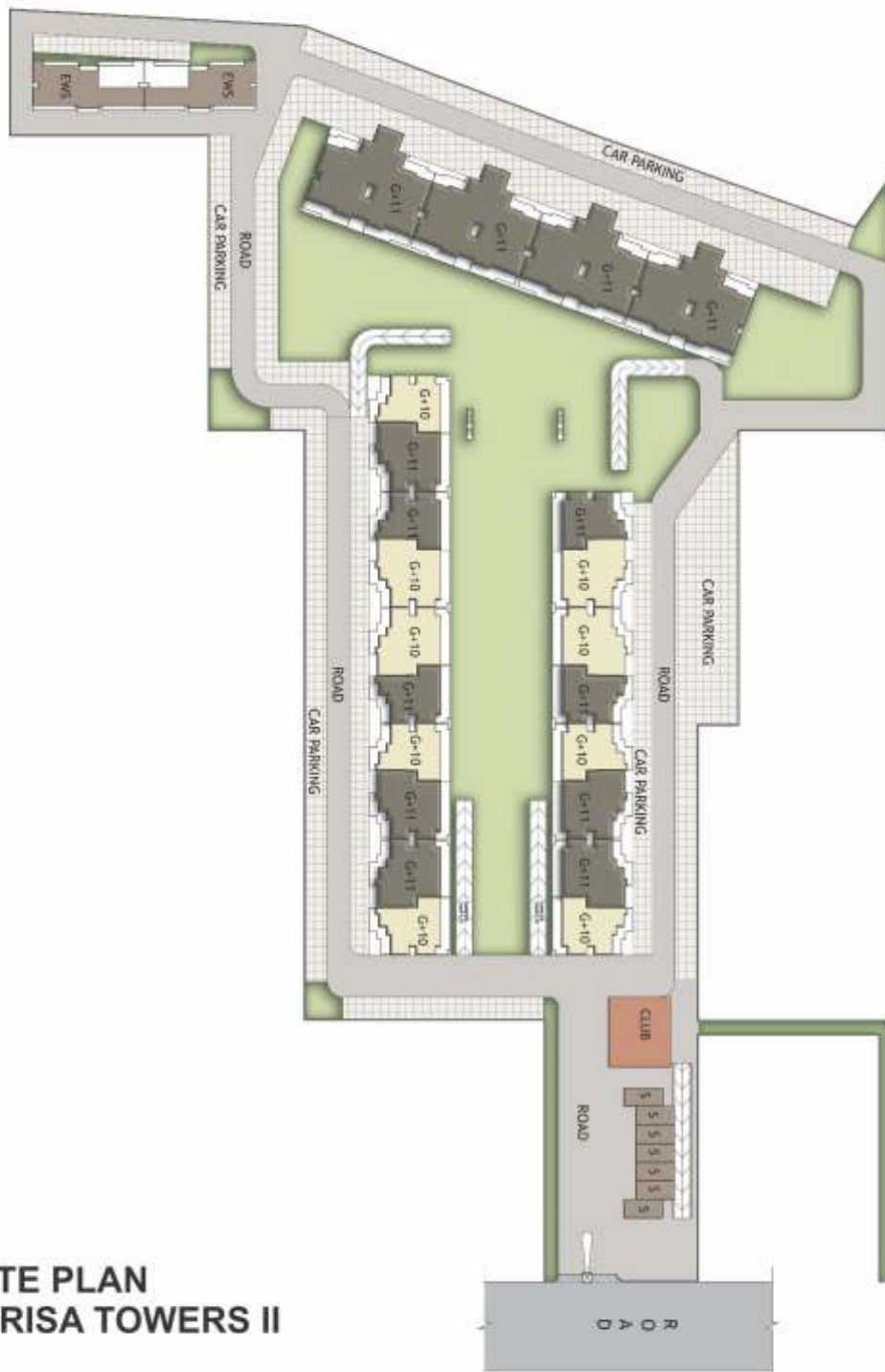
SITE PLAN GIRISA TOWERS II