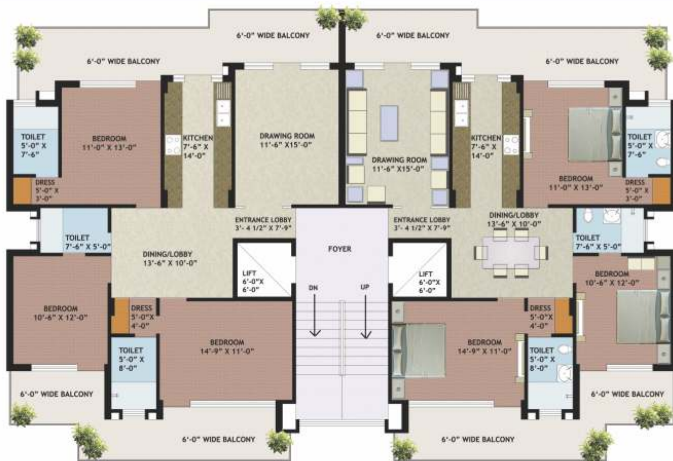
FLOOR PLAN OF 3BHK GIRISA I