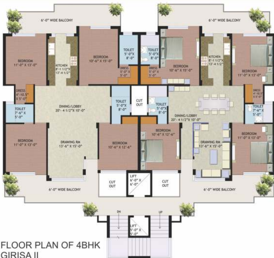
FLOOR PLAN OF 4BHK GIRISA II