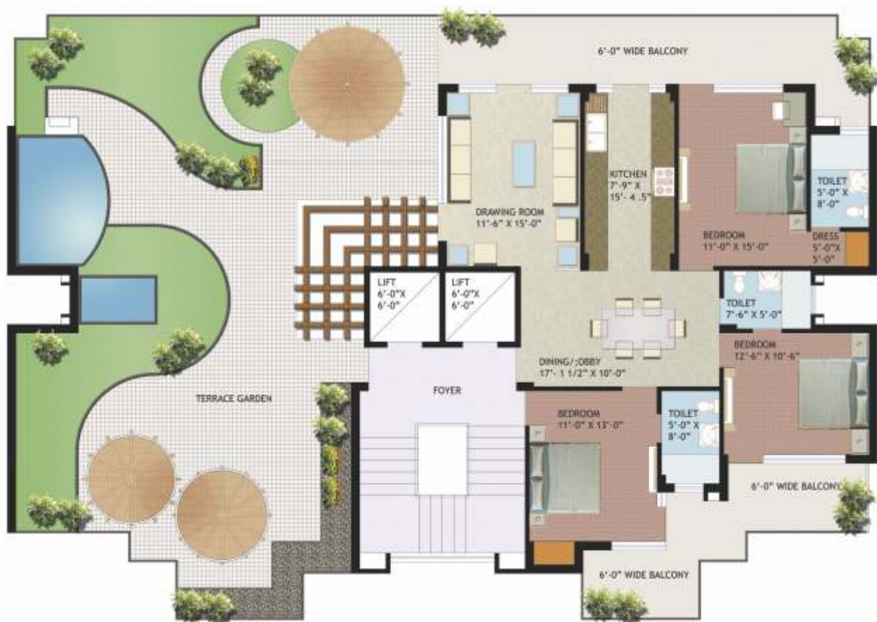
FLOOR PLAN OF PENTHOUSE - B