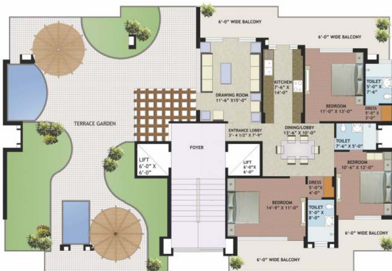
FLOOR PLAN OF PENTHOUSE - A