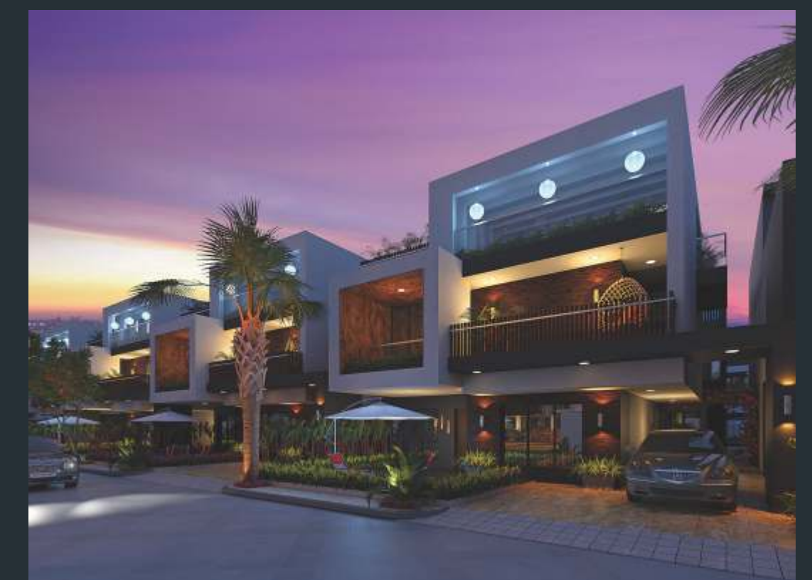
5 BHK Villa Plot size : 2888 Sq. Ft