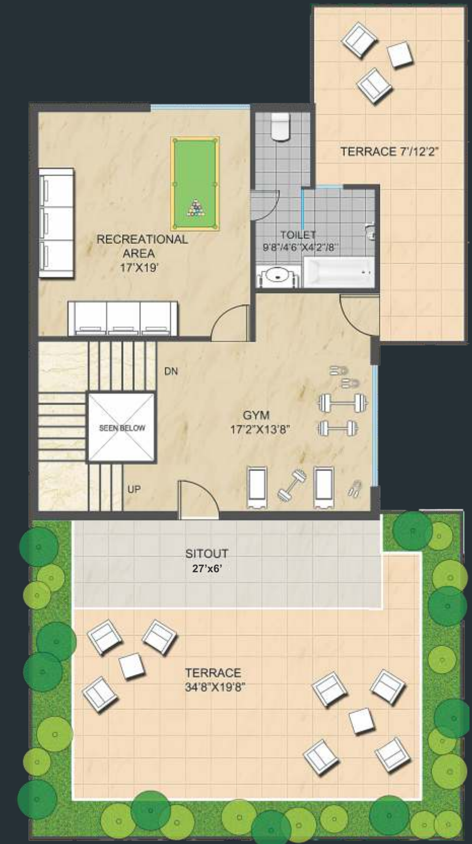
SECOND FLOOR Built up area 1524 sq.ft.

"Dare to live the life you have dreamed for yourself"