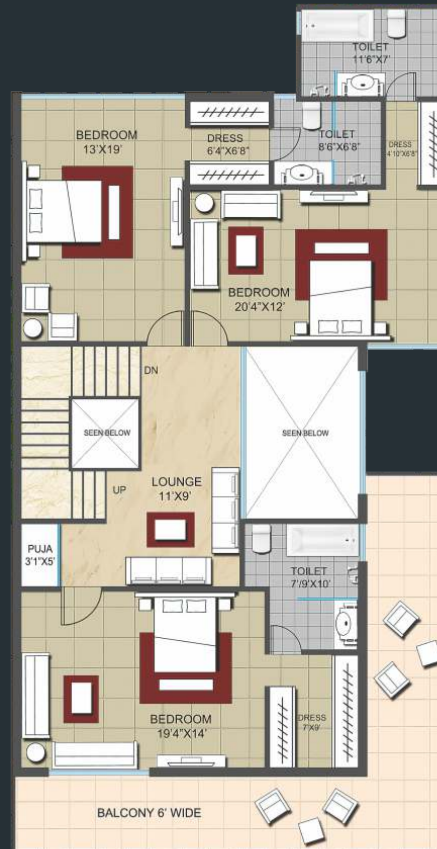
FIRST FLOOR Built up area 2117 sq.ft.