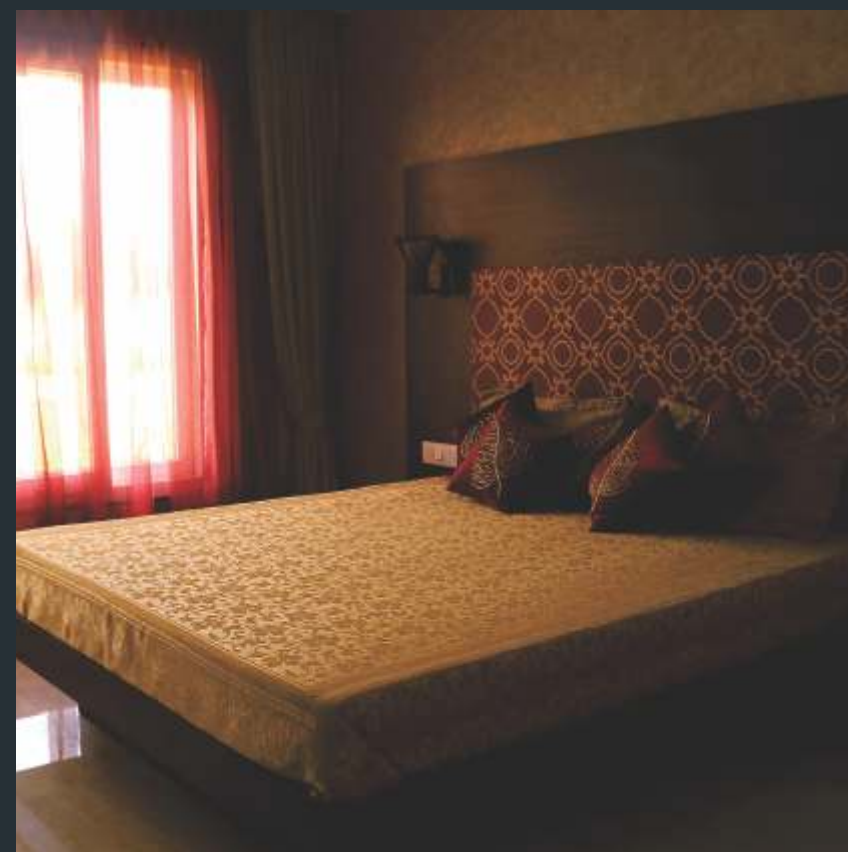
ALL ACTUAL PHOTOGRAPHS OF THE SHOW UNIT