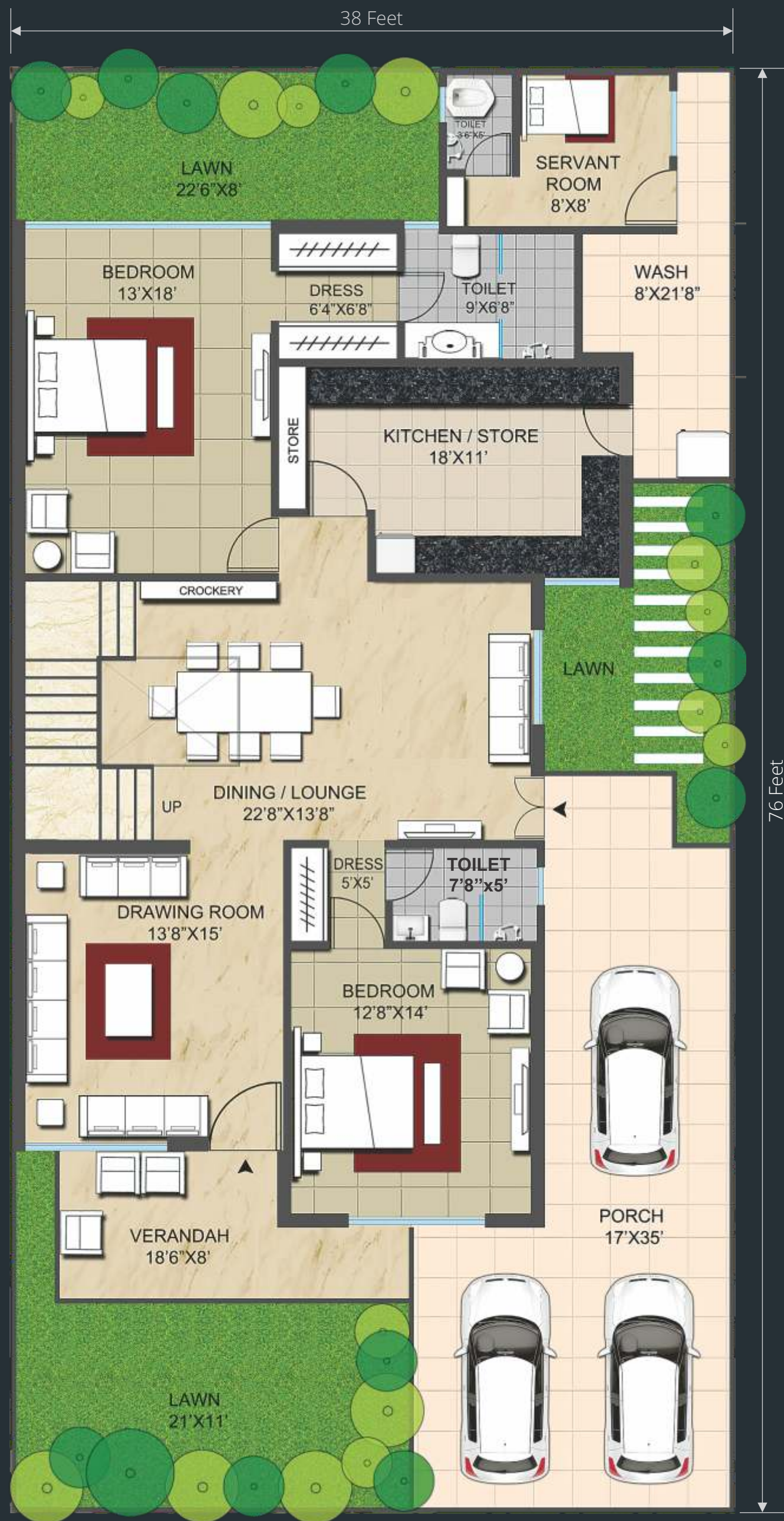
GROUND FLOOR Built up area 2159 sq.ft.