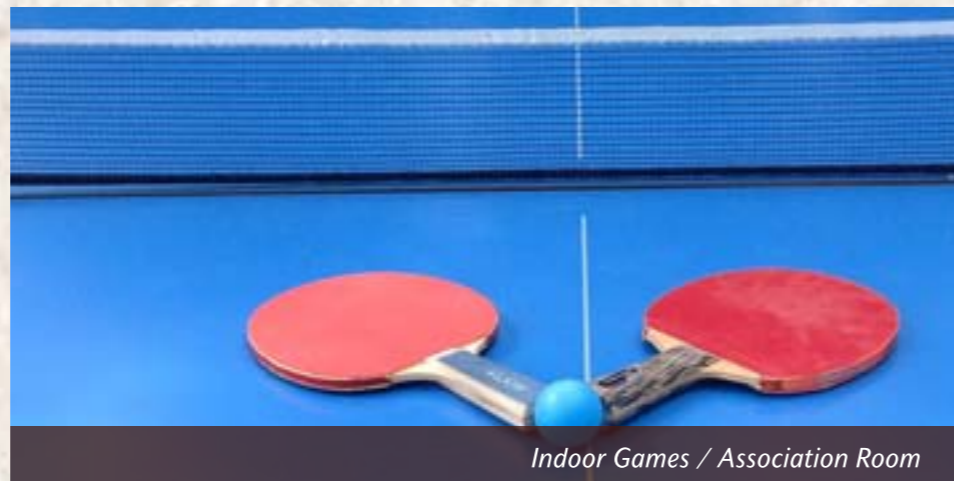
Indoor Games / Association Room