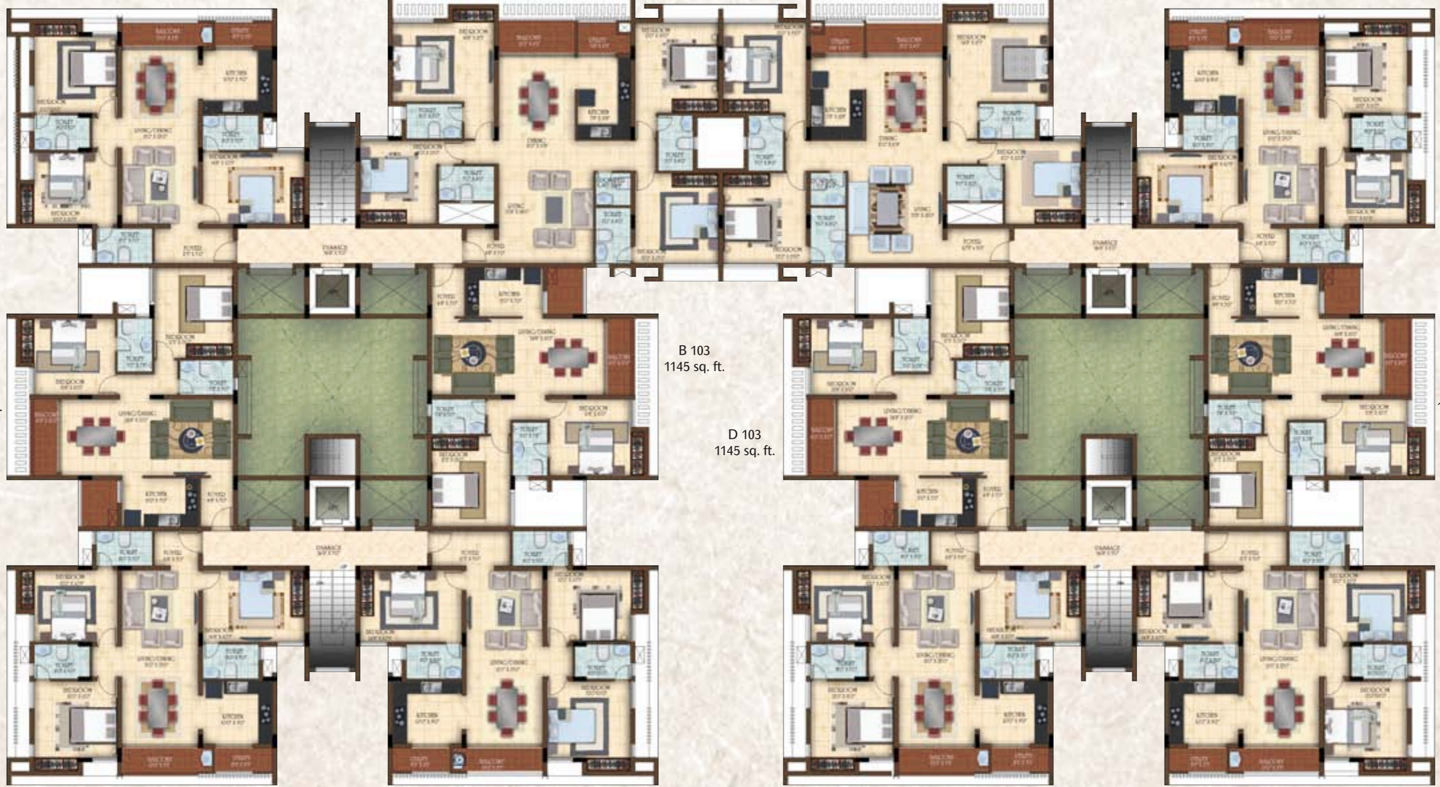
A 103 1145 sq. ft.