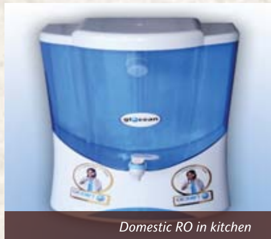
Domestic RO in kitchen