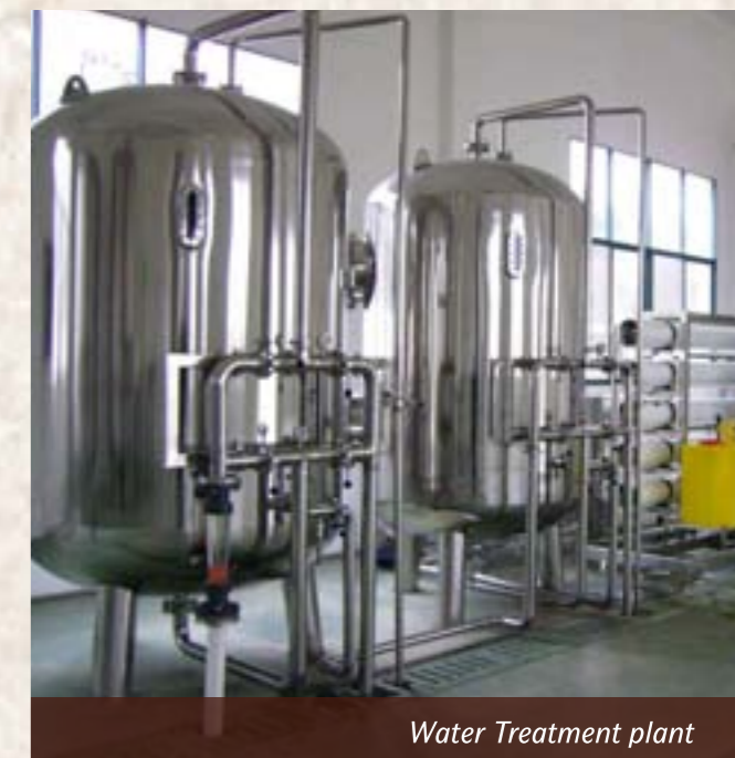
Water Treatment plant