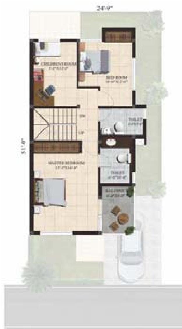
FIRST FLOOR PLAN TYPE - C