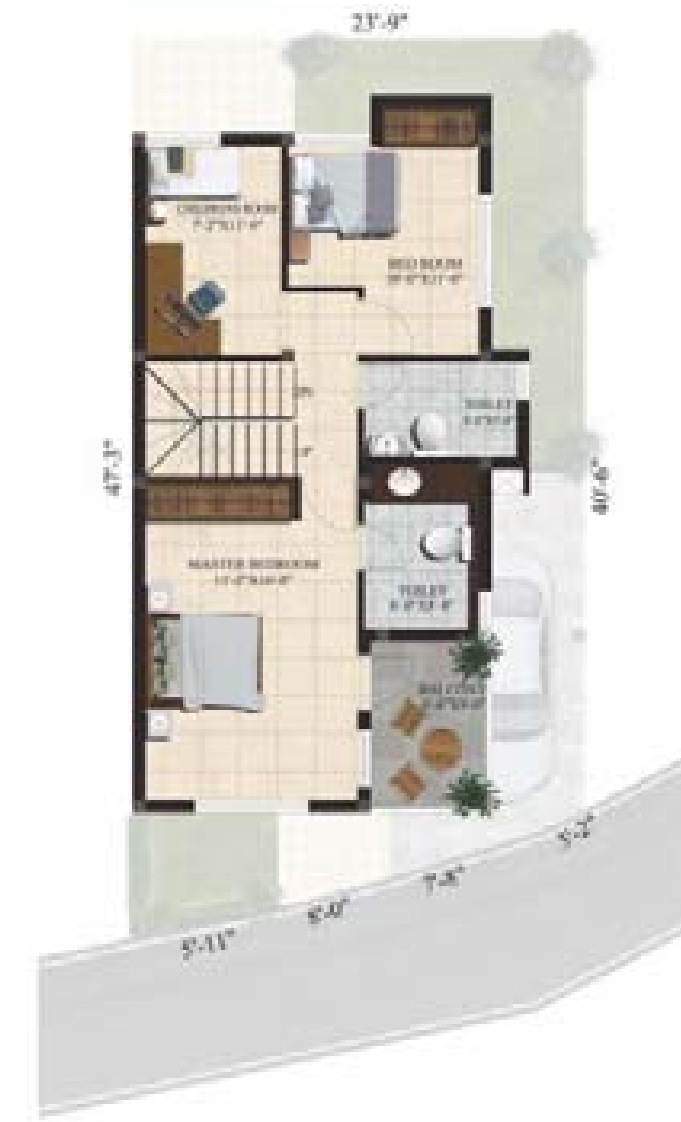
FIRST FLOOR PLAN TYPE - F

Land Area: 1054 Built-up Area: 1492 Villa Numbers: 4