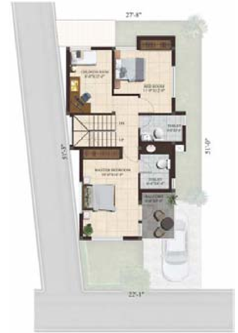
GROUND FLOOR PLAN TYPE - A

Land Area: 1271 Built-up Area: 1573 Villa Number 16