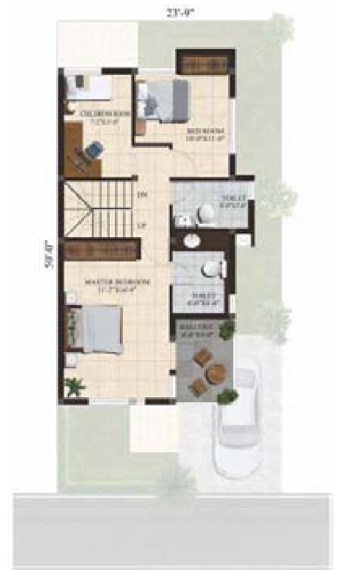
FIRST FLOOR PLAN TYPE - D