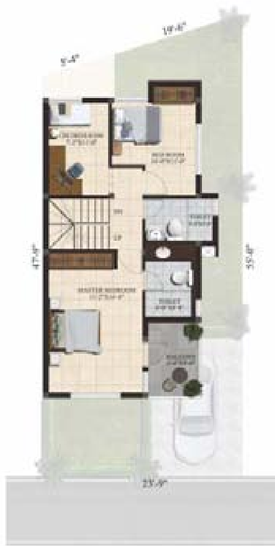
FIRST FLOOR PLAN TYPE - E

Land Area: 1215, 1377 Built-up Area: 1486 Villa Numbers: 5, 6