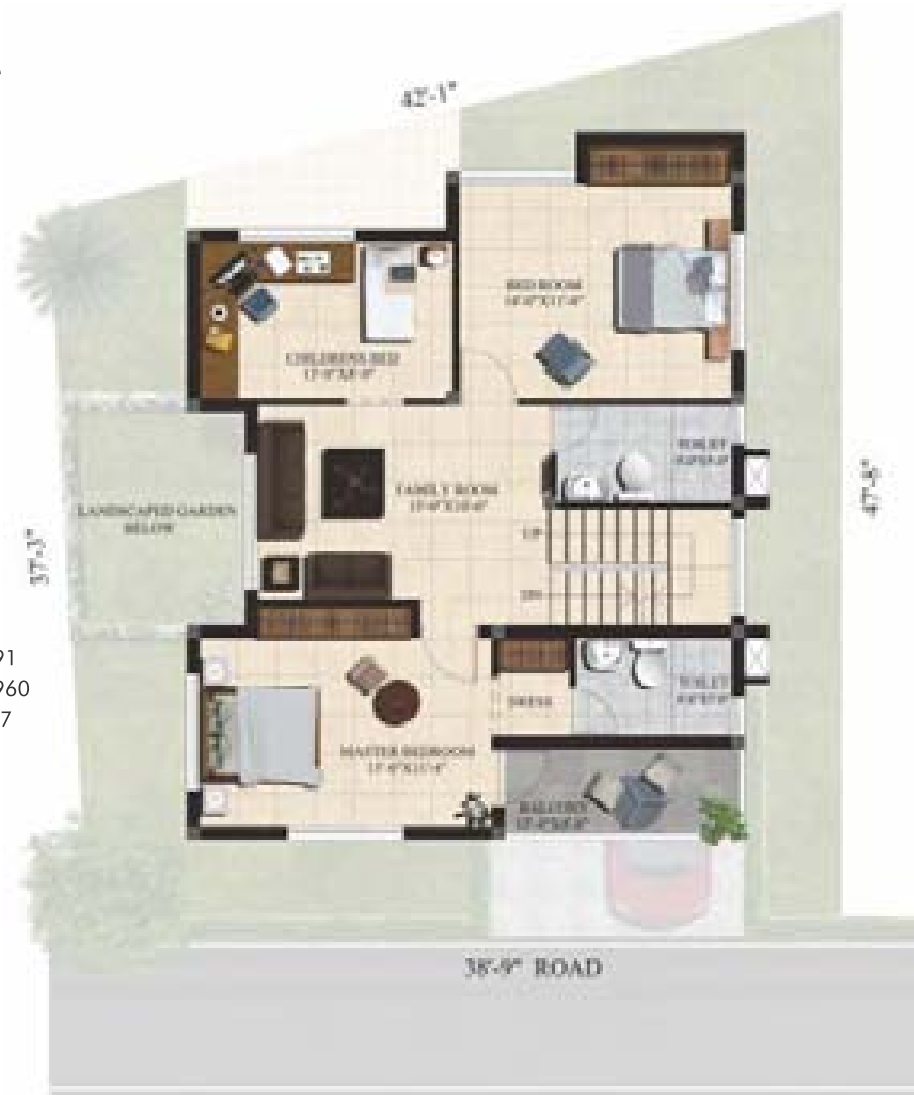
FIRST FLOOR PLAN TYPE - G