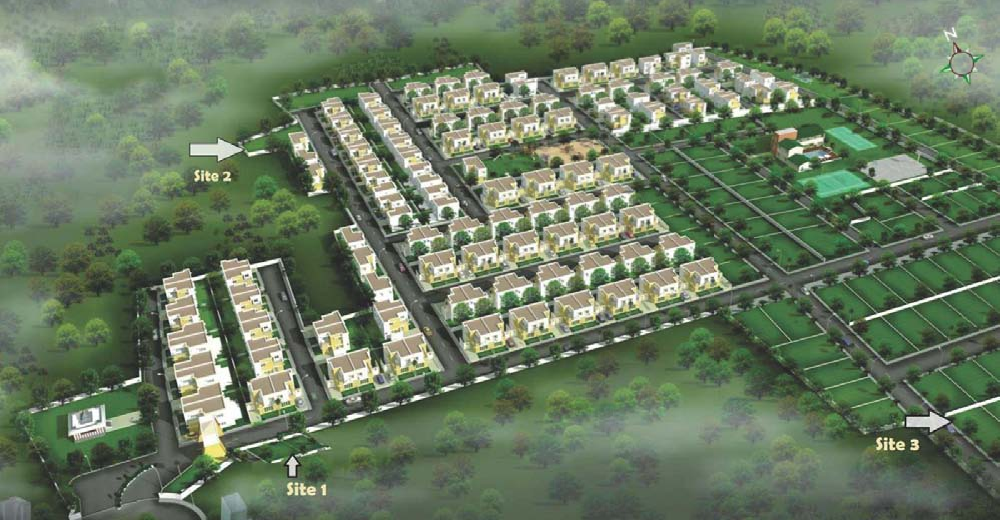
CASA GRANDE URBANO PHASE 2 - AN AERIAL VIEW