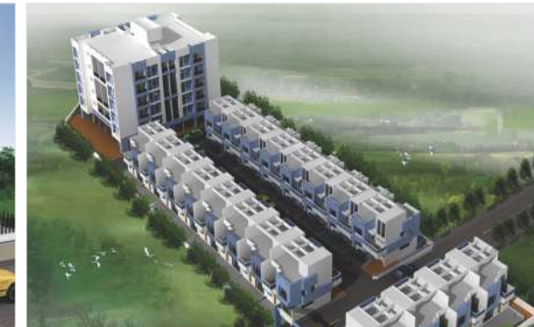
Meadows Uptown - Shahnoorwadi - Aurangabad