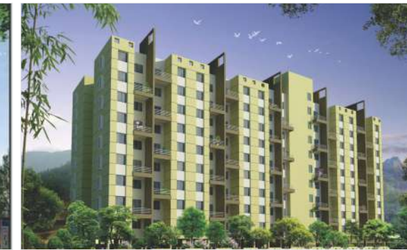
Meadows Habitat - Pashan - Pune