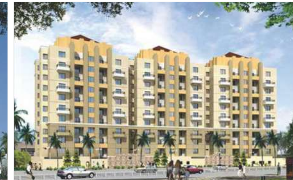
Dev Exotica - Kharadi - Pune