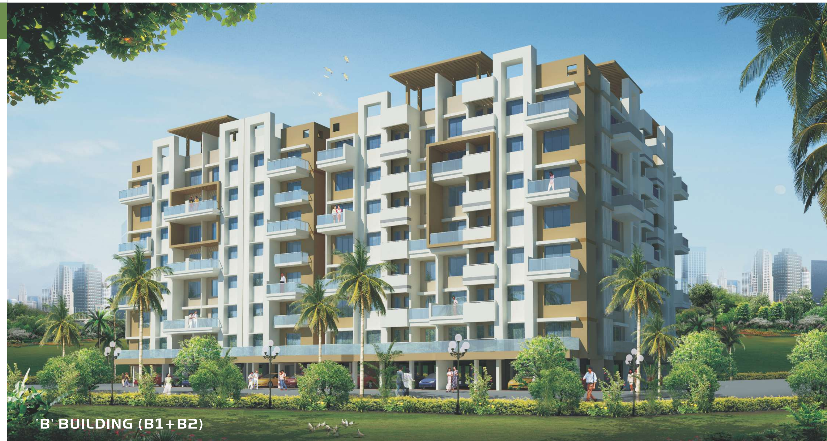
'B' BUILDING (B1+B2)