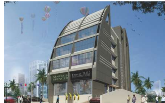
Commercial Complex - at N-3 CIDCO - Aurangabad