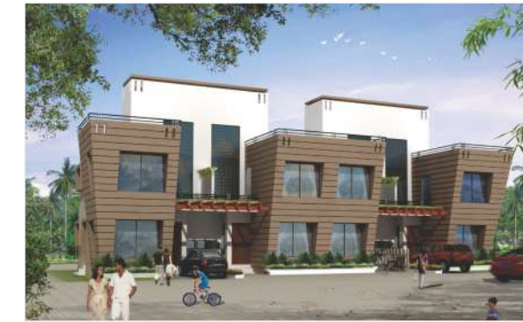
Meadows Mystique - Wagholi - Pune