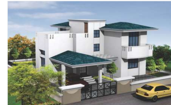
Meadows Hillview Homes - Nashik Road - Aurangabad