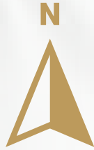
TYPICAL FLOOR PLAN 1ST 4TH & 7TH FLOOR PLAN