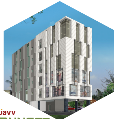
arrjavv CONNECT Kasba