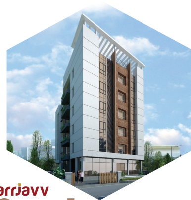
arrjavv Pearl Bhawaniपुर

With lofty visions to provide a superior quality of life to the city's denizens, serve them with humility and continually exceed their exacting standards, we stride ahead - while being firmly rooted in the spirit of Arrjavva.