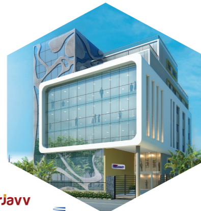
arrjavv SQUARE Elliot Road