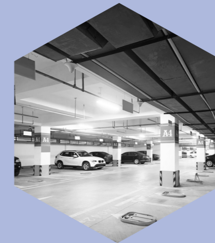
Adequate Parking Space