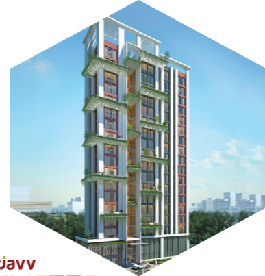
arrjavv CAVETTO Jodhpur Park