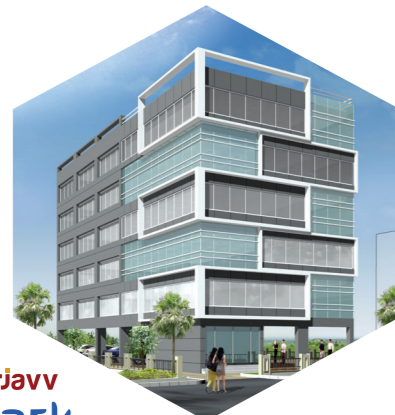
arrjavv Park Sarat Bose Road