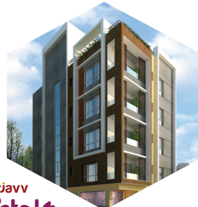
arrjavv Petals Bhawaniपुर