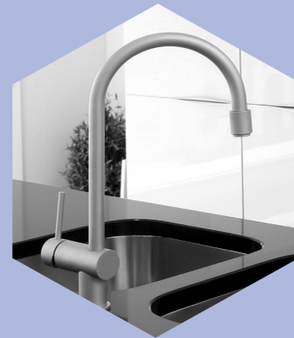
Top of the Line Fittings