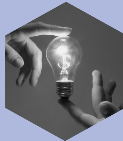
24X7 Power Backup