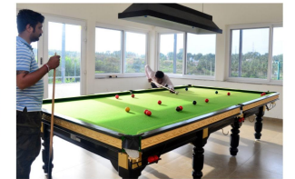
ACTUAL PROJECT IMAGES. NO ARTISTIC RENDITIONS.