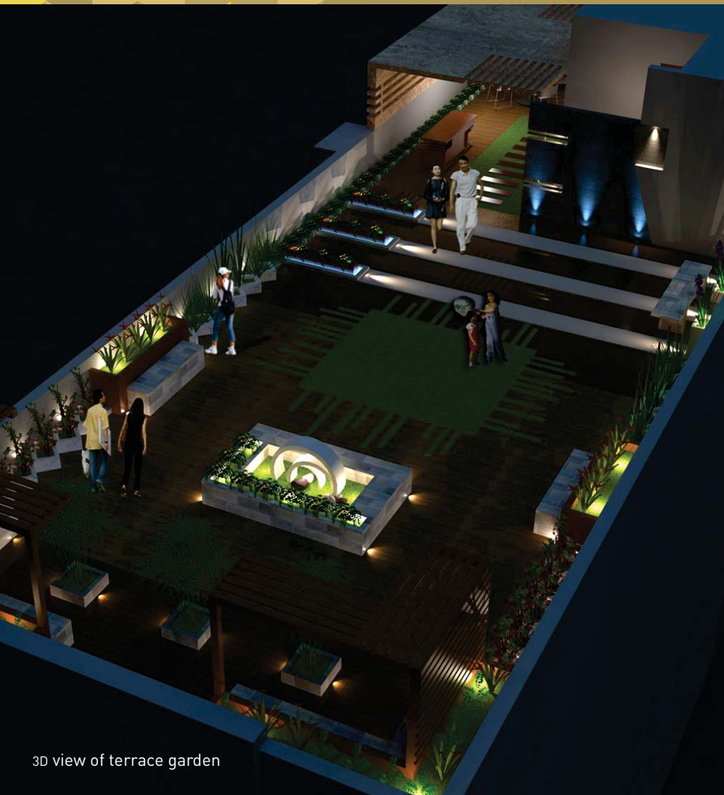
3D view of terrace garden