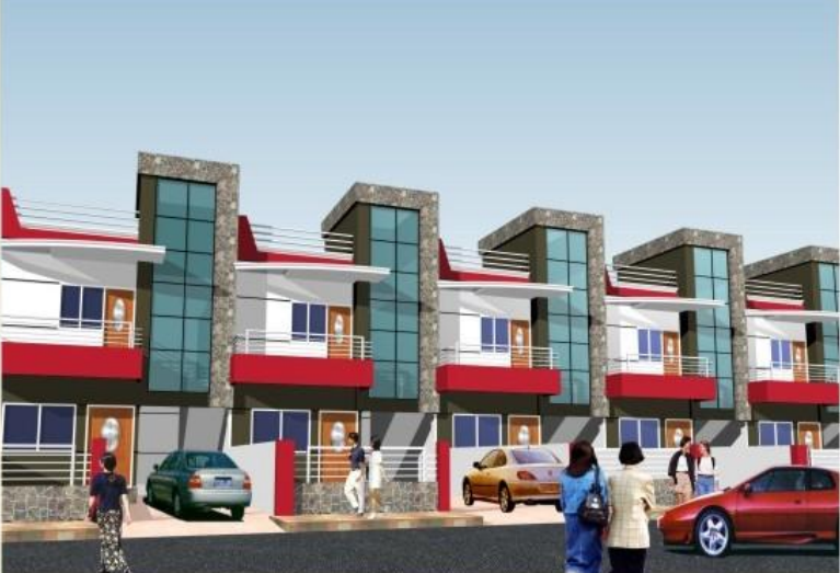
Tejaji Nagar, By-pass, Khandwa Road, Indore