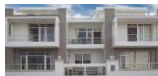
Canal View - Built up Villas, Ludhiana