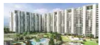
Falcon View Sector 66-A, Mohali