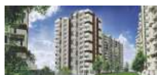
Sky Gardens Sector 66-A, Mohali