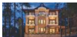
Actual Photograph of Villa No. 4 Sanawar Hills - Luxury Villas, Kasauli