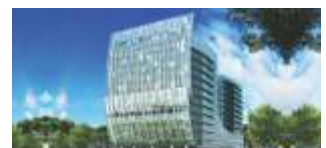
JLPL Twin Towers Sector 66-A, Mohali