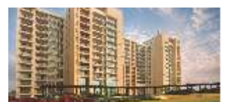
Regency Heights Sector 90, Mohali (Delivered)