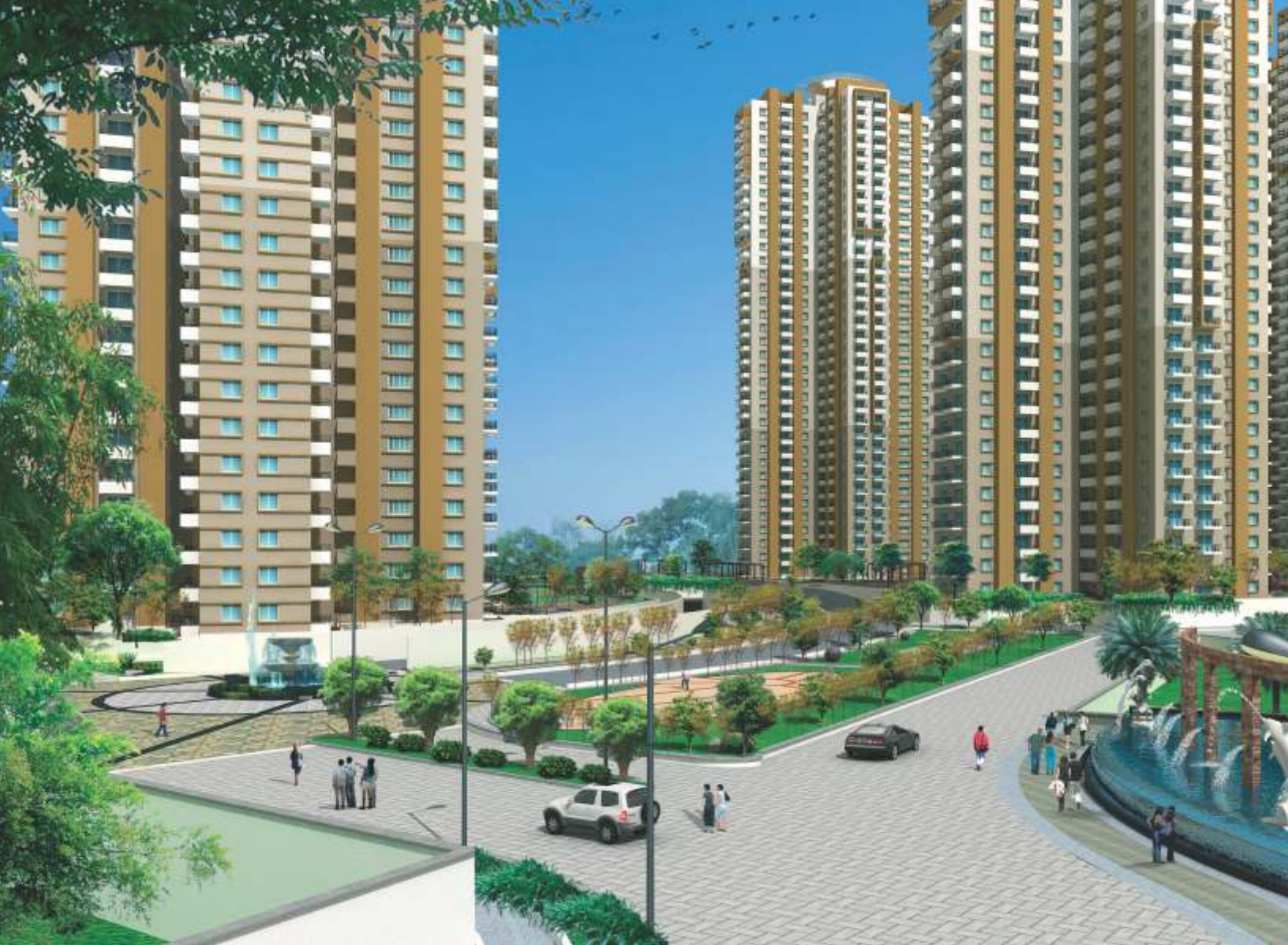
Pashmina Waterfront at Bangalore