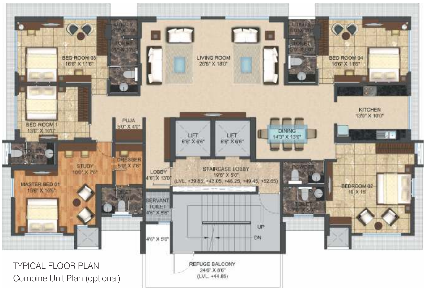
TYPICAL FLOOR PLAN Combine Unit Plan (optional)