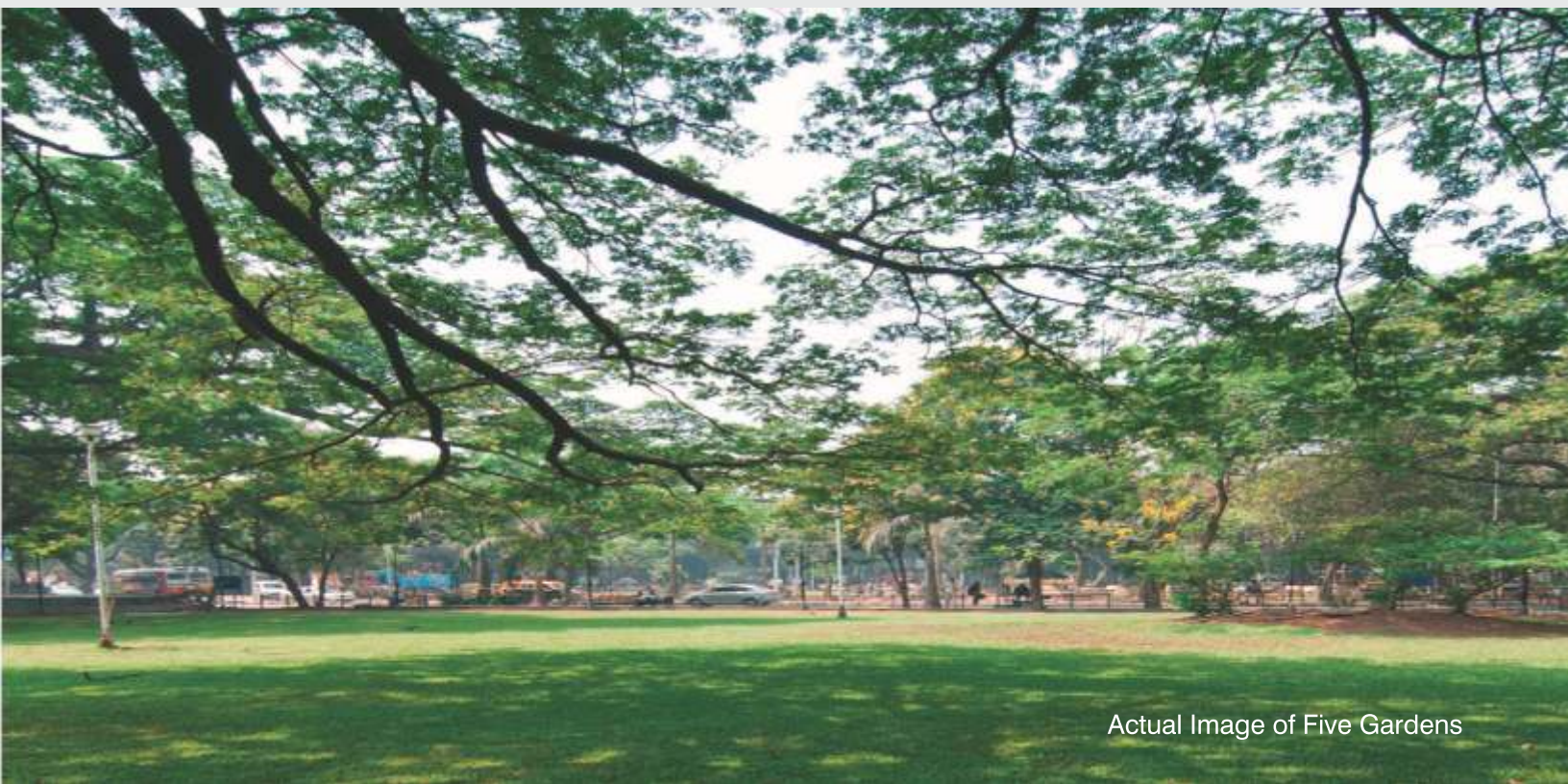
Actual Image of Five Gardens