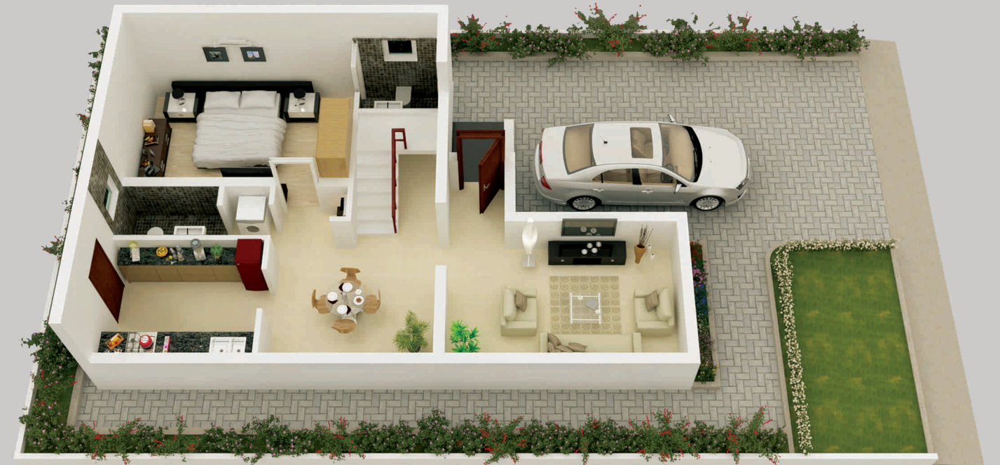
Ground Floor 1062 Sq.ft