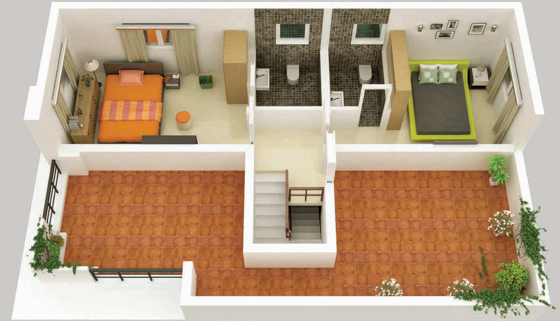
First Floor 600 Sq.ft