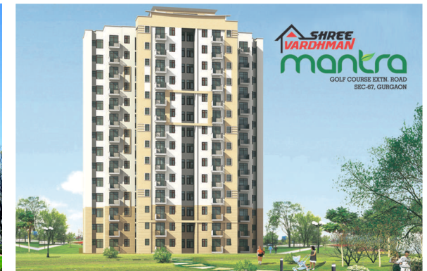
SHREE VARDHMAN MANTRA 11.26 Acre Group Housing Sector - 67, Gurgaon