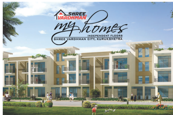
SHREE VARDHMAN MY HOMES Luxurious Independent Floors Sector-30, Kurukshetra