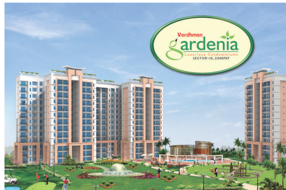
SHREE VARDHMAN GARDENIA 14 Acre Group Housing Sector - 10, Sonapat