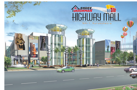
SHREE VARDHMAN HIGHWAY MALL 2 Acre Retail Mall and Multiplex on NH-1, Kurukshetra