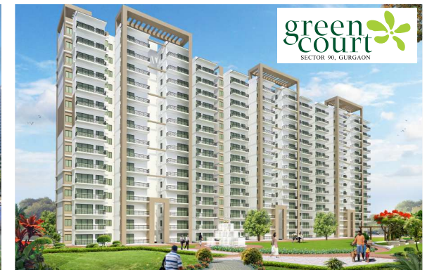
GREEN COURT 10.05 Acre, Affordable Group Housing Sector - 90, Gurgaon