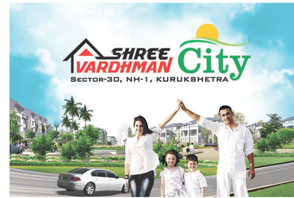
SHREE VARDHMAN CITY 50.125 Acre Township Sector-30, NH-1, Kurukshetra

daunting passion. Every endeavor and effort clearly emphasises the credibility and integrity of the group. The group is well known for its commitment to quality and transparency in its projects. The projects of group are located at most prime locations in Gurgaon, Sonapat, Kurukshetra and Panchkula. Shree Vardhman Group has carved a niche for its self in the real estate industry in India, having approx. more than 7000 satisfied customers in its various projects.