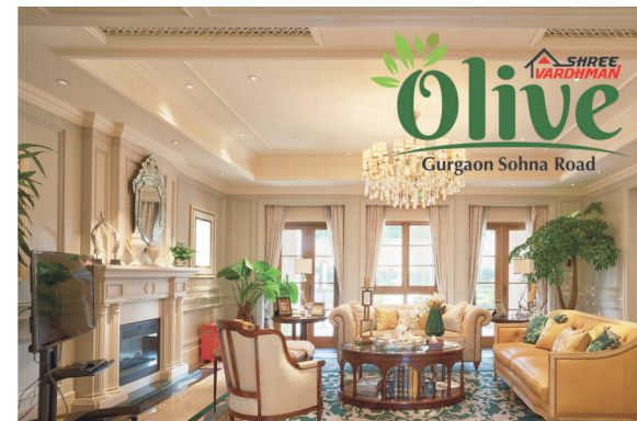
SHREE VARDHMAN OLIVE 11.0 Acre Group Housing Sohna-Gurgaon Road