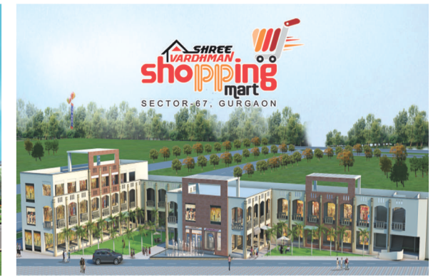
SHREE VARDHMAN SHOPPING MART Shopping Centre Sector -67, Gurgaon