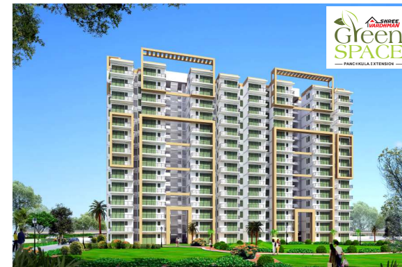
SHREE VARDHMAN GREEN SPACE 5.0 Acre Group Housing Sector-14, Panchkula Extension