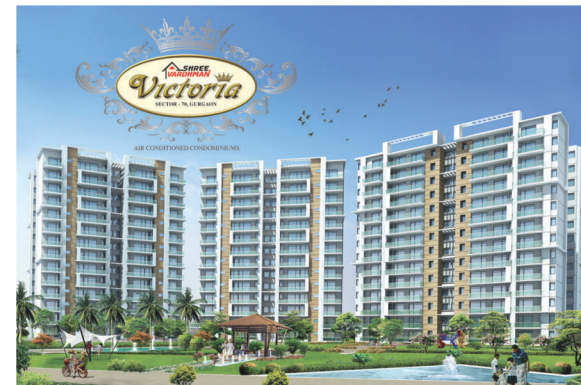
SHREE VARDHMAN VICTORIA 10.96 Acre Premium Group Housing Sector - 70, Gurgaon