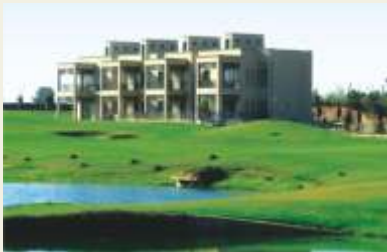
Tarudhan Valley Golf Resort