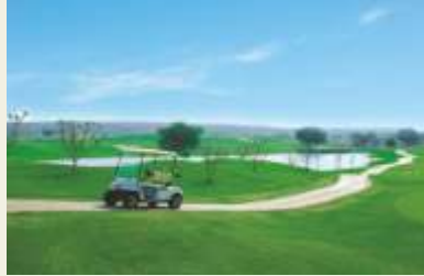
Classic Golf Resort**