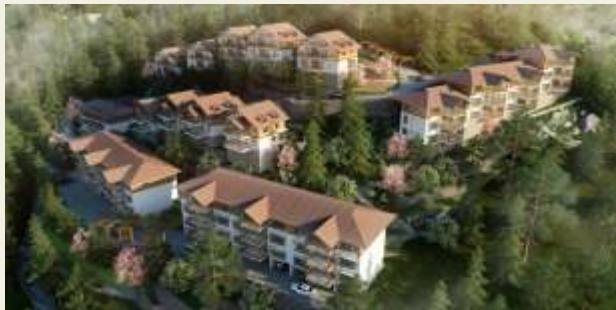
Silverglades Hill Homes - Kasauli