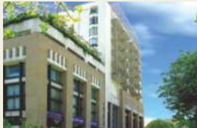
The Peach Tree*