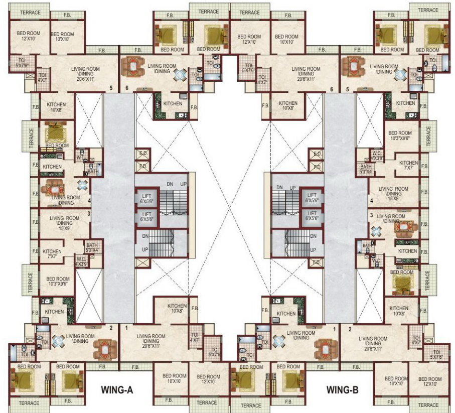
2ND, 4TH, & 6TH FLOOR PLAN