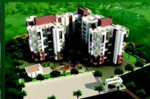
Vishwa - Narhe