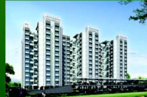
Eva - Bavdhan