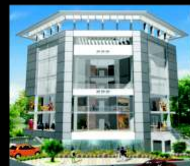
The Vitoria - Deccan Gymkhana