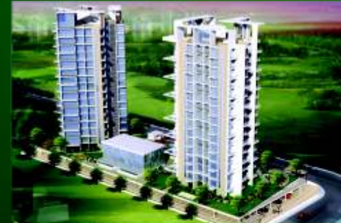
Valencia - Navi Mumbai