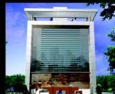
KaranTej Bonita - Ghole Road