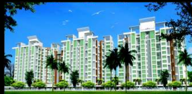
Madhupushpa - Wakad