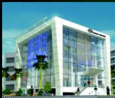
Karan House - Prabhat Road