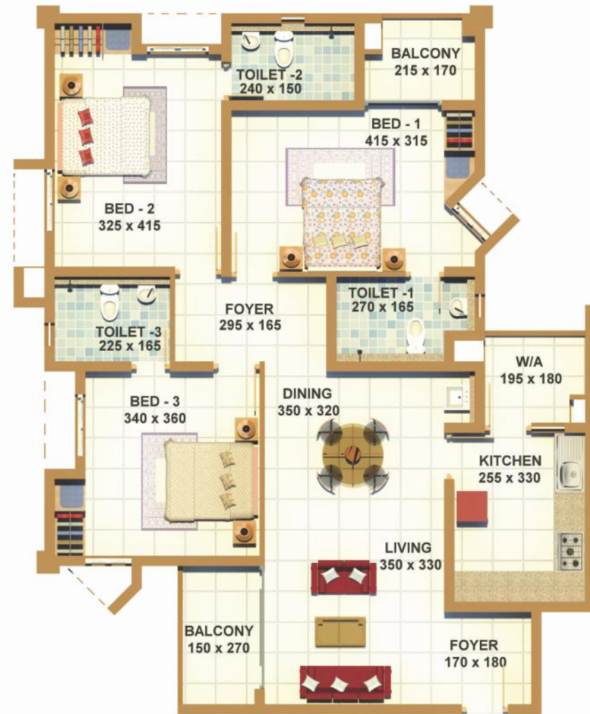
3 BED UNIT - C AREA - 1585 sq.ft.