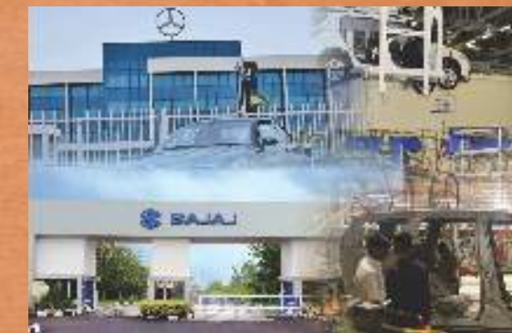
Chakan Industrial Area