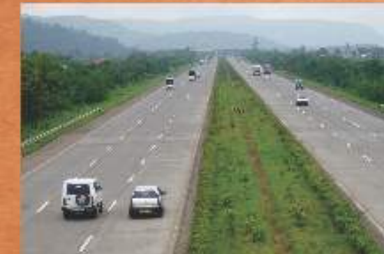
Pune - Mumbai Expressway