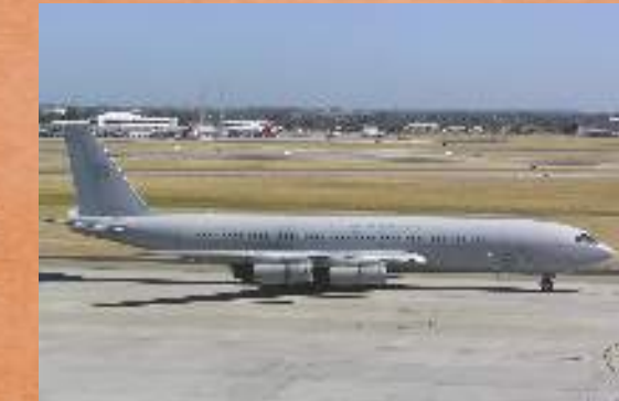
Proposed Chakan & Panvel Airport