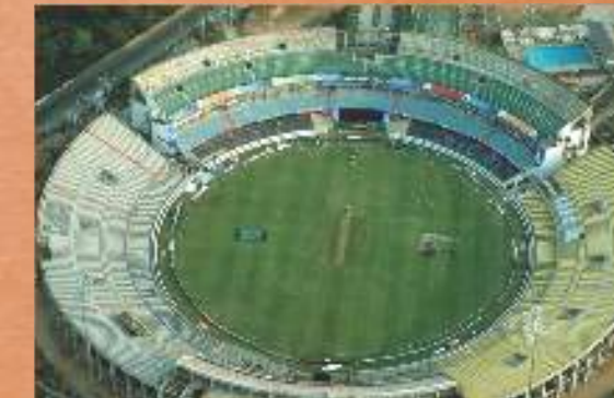
International Cricket Stadium at Gahunje