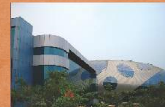
Hinjewadi IT Park