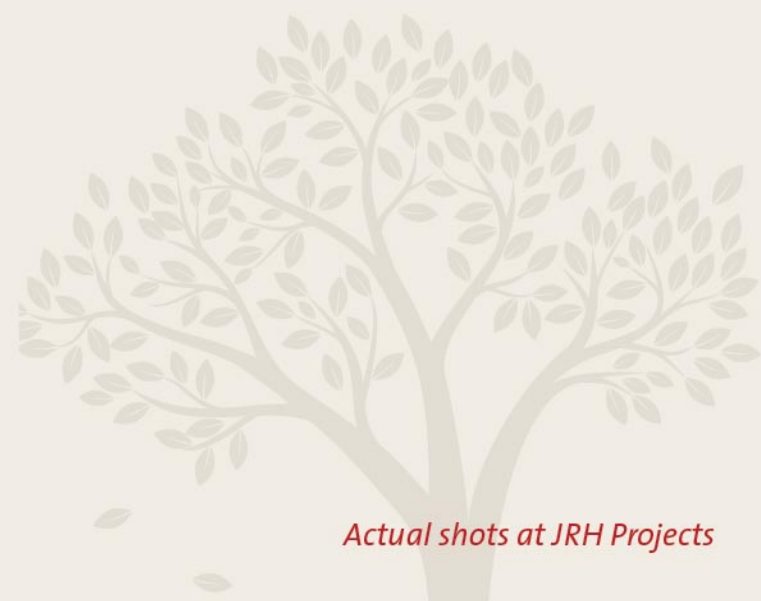
Actual shots at JRH Projects

The property is just a 20-minute drive from Koramangala via the elevated expressway. You also enjoy easy access to the Central Business District while you are connected to all parts of the city through the BMRDA Ring Roads. Its location on the Bangalore-Hosur expressway also means that if you need to head out of the city on business or on holiday you have a smooth and easy exit.