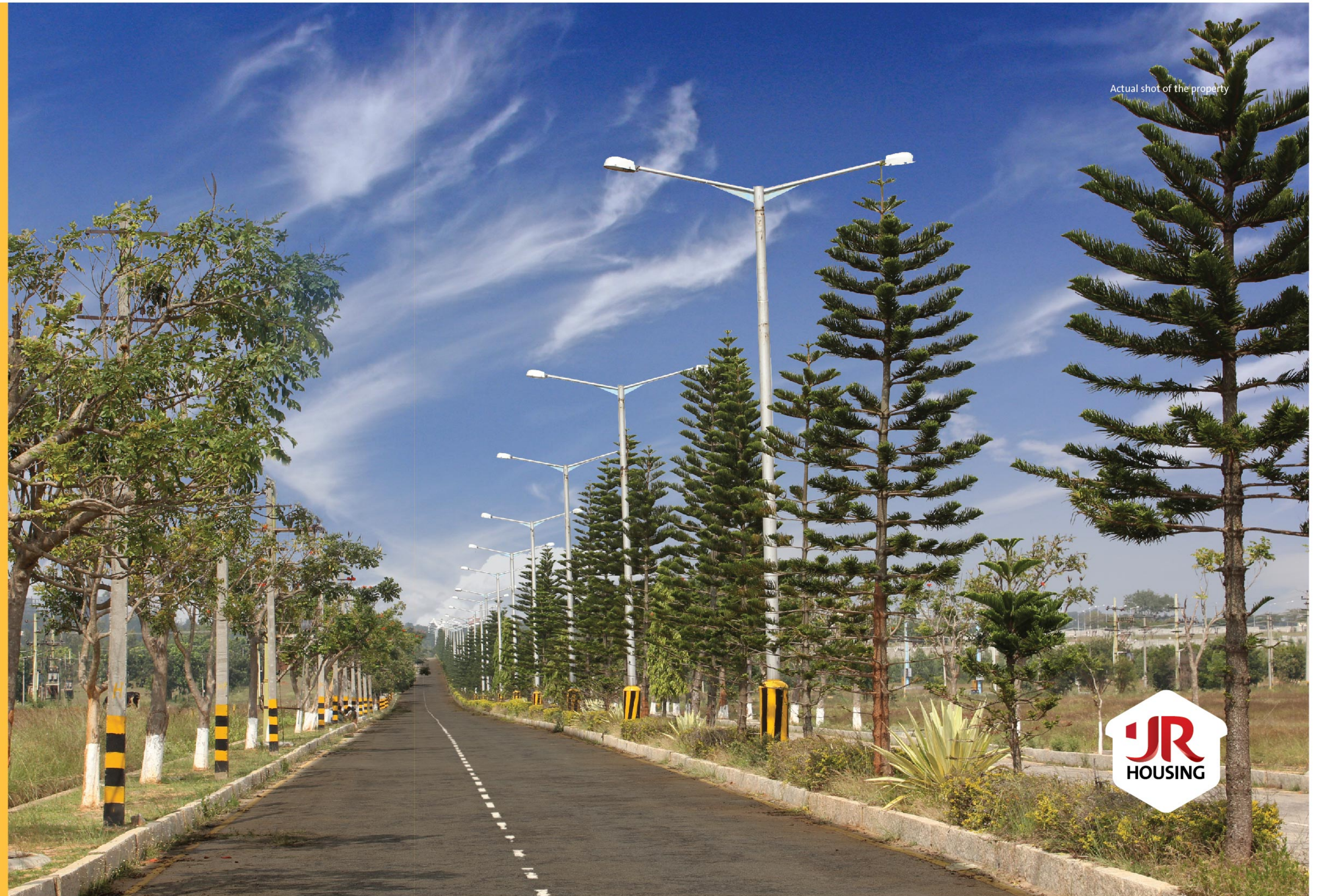
Actual shot of the property