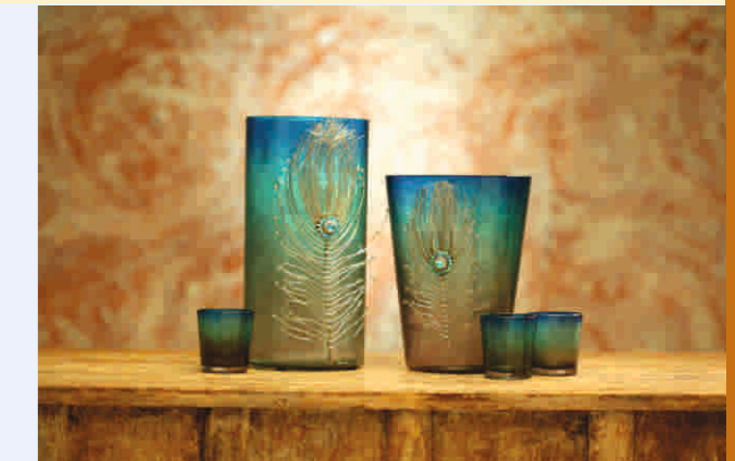
Actual Photograph of Zing Product

INTERIOR DESIGNING PROPERTY MANAGEMENT MAINTENANCE | RENTAL SERVICES