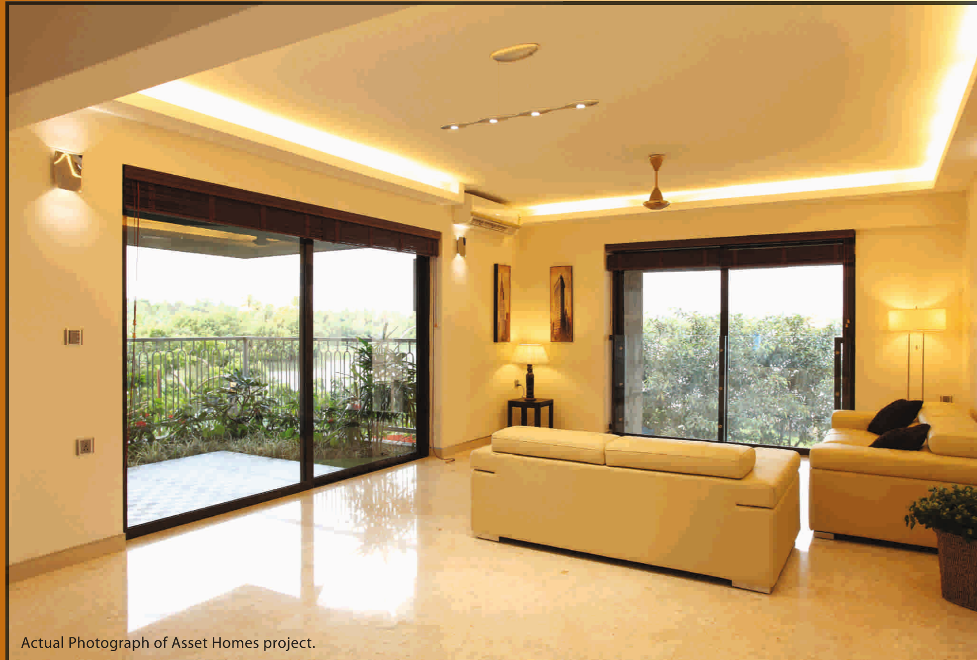
Actual Photograph of Asset Homes project.