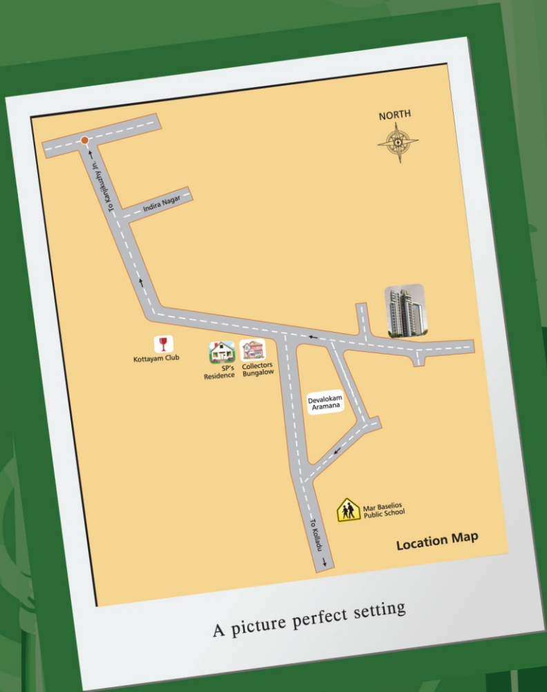
A picture perfect setting