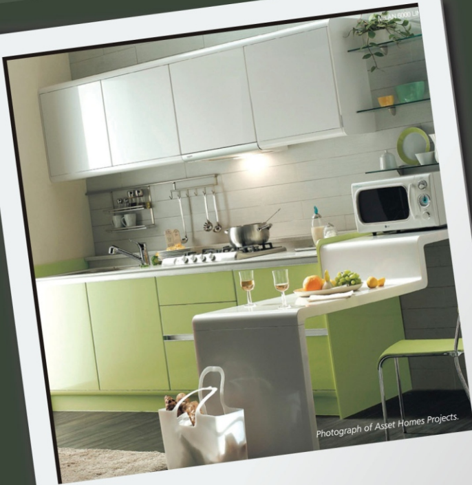
Photograph of Asset Homes Projects.