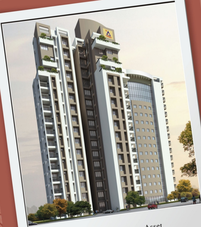
A master stroke from Asset