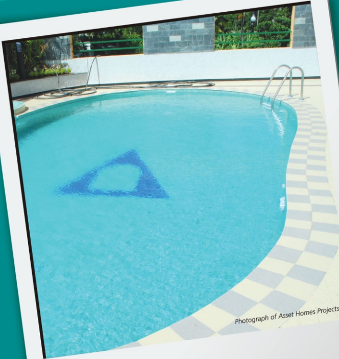
Photograph of Asset Homes Projects.