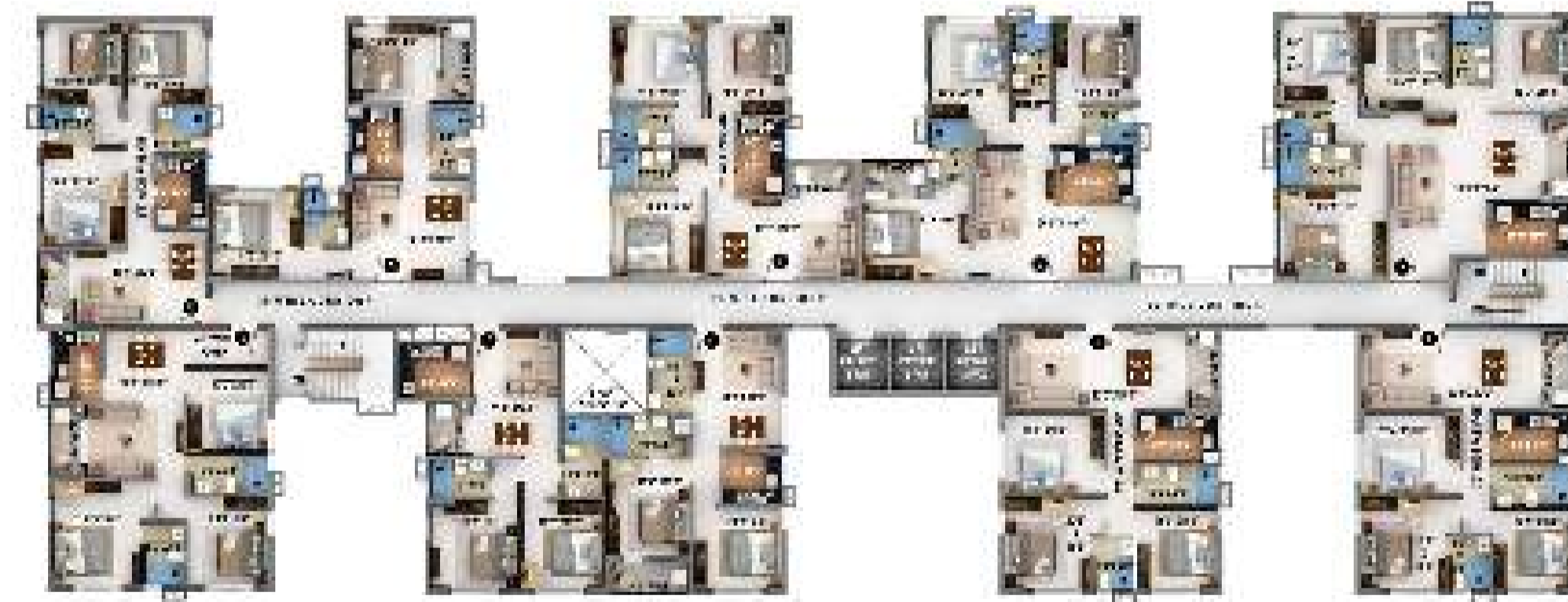
Typical Floor Plan(2nd-11th)*