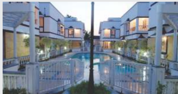
Chesterfields - Tudor Styled Architecture