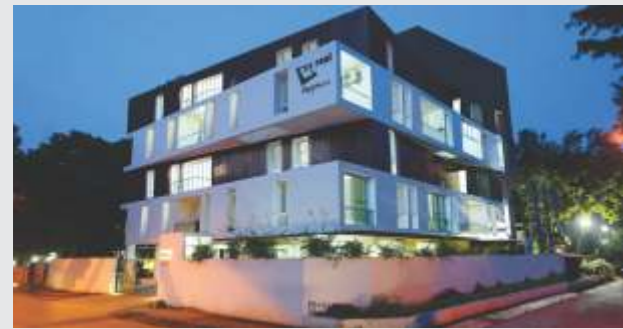
GreenEdge - Scandinavian Styled Architecture

Only developer in the country to deliver projects with 8 different Thematic Architecture.