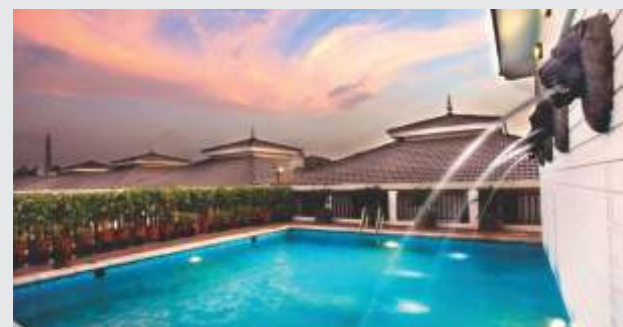
Villa Bali - Balinese Styled Architecture