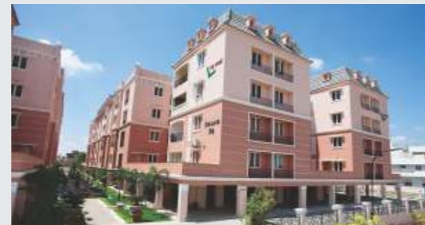
La Celeste - French Styled Architecture