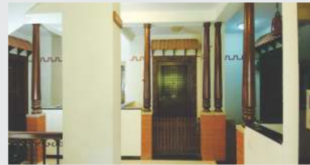
Prathyeka - Chettinad Styled Architecture