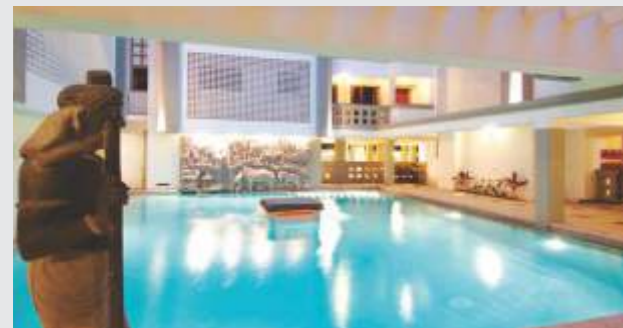
Pallava Heights - Pallava Styled Architecture