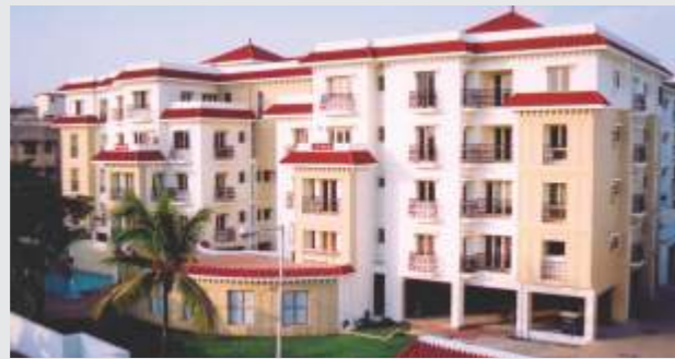
Villa Espana - Spanish Styled Architecture