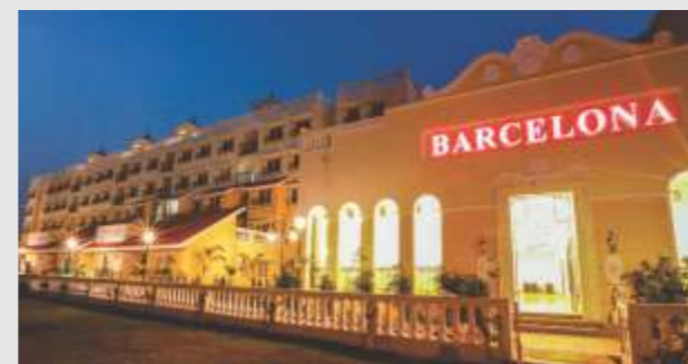
Catalunya City - Spanish Styled Architecture