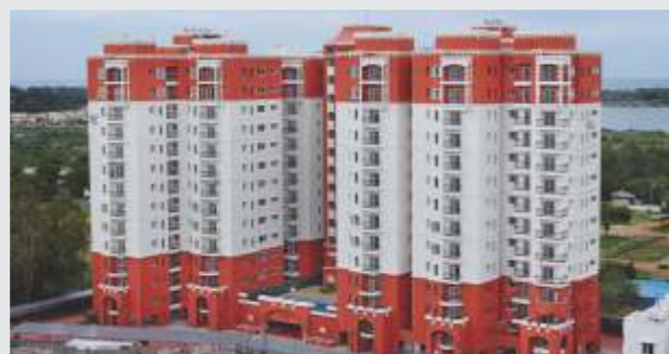
Siena - Tuscan Styled Architecture