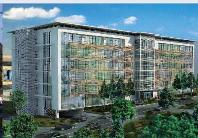
Signature Towers, Dehradun