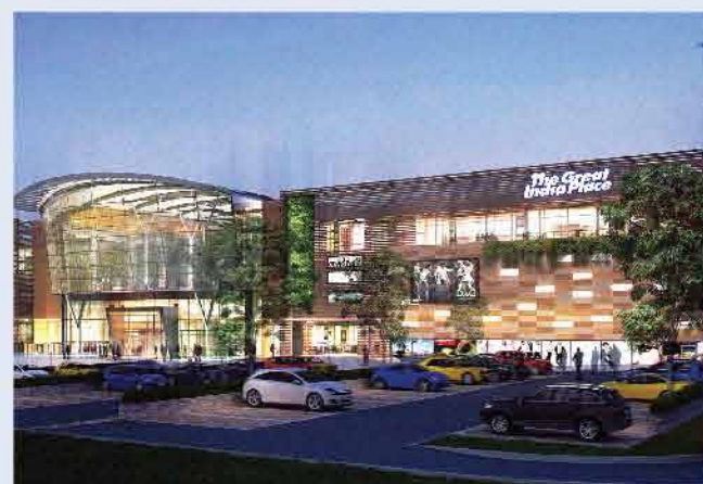
The Great India Place, Dehradun