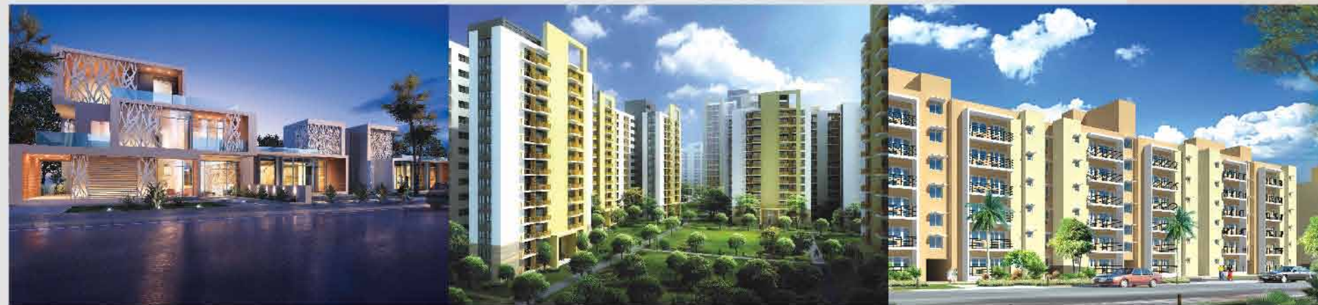
Escape Premiere, Gurgaon

Unitech's enviable clientele for commercial projects includes Fidelity, McKinsey, Bank of America, Ford Motors, Nike, EDS, Hewitt, Amdocs, Ernst & Young, Reebok, Keane, Seagrams, Perfetti, Exxon Mobil and AT Kearney.