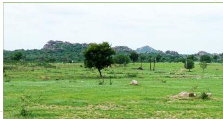
Actual Pictures of Serene surrounding