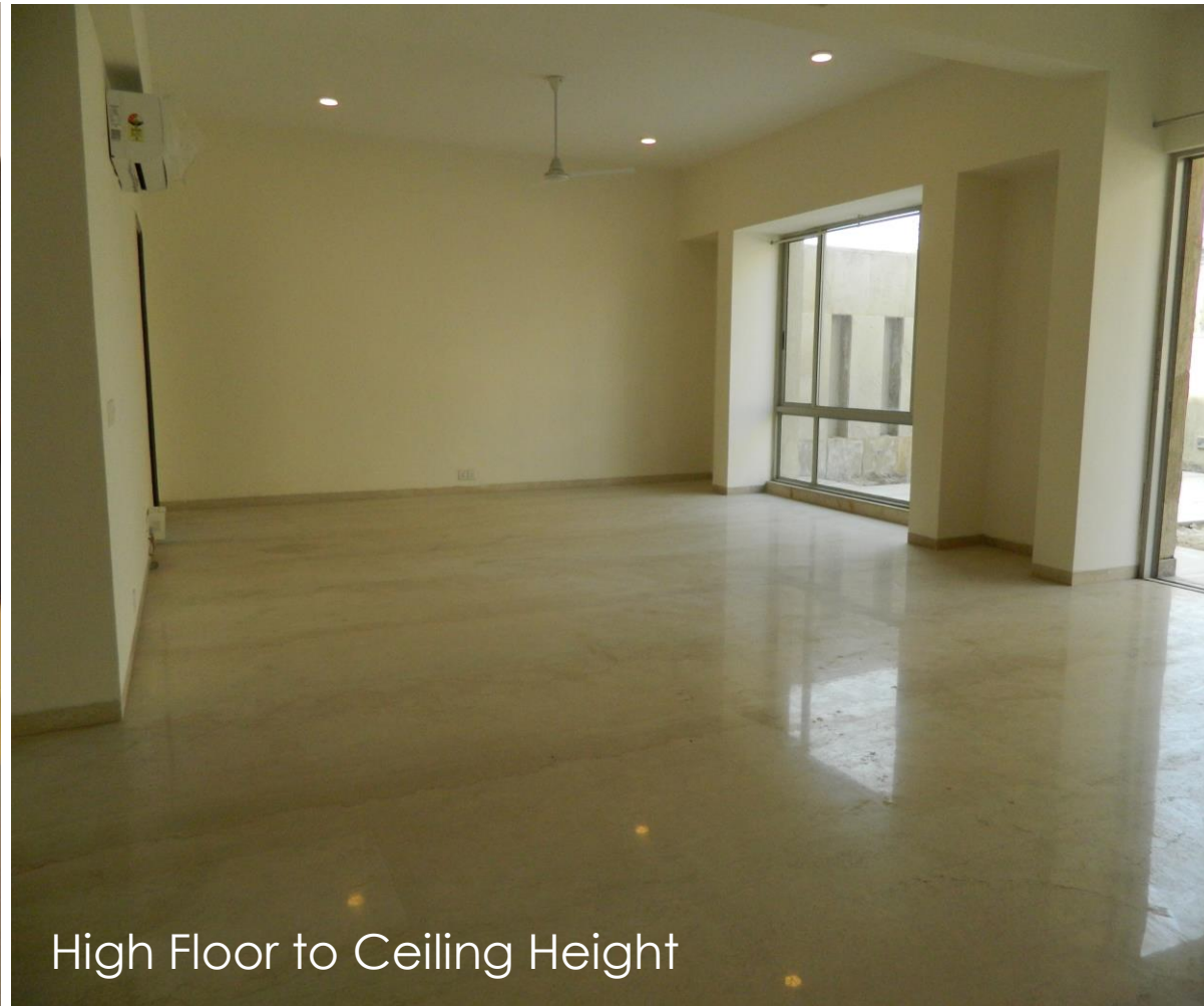
High Floor to Ceiling Height