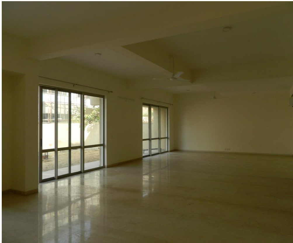
Italian Marble & Hardwood Flooring