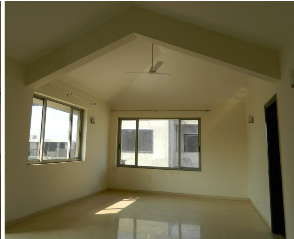
Natural Lighting & Ventilation