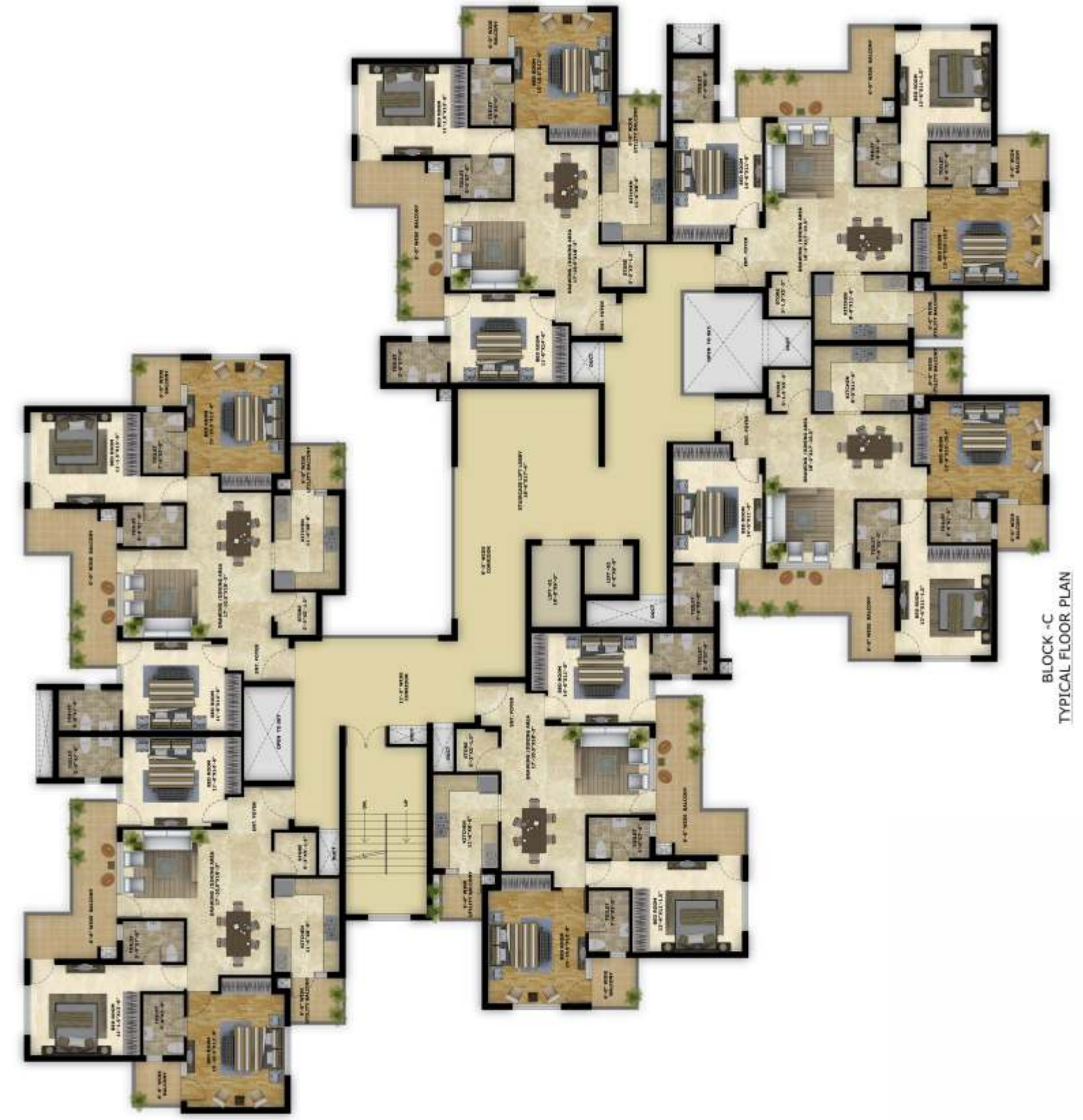
BLOCK - C TYPICAL FLOOR PLAN