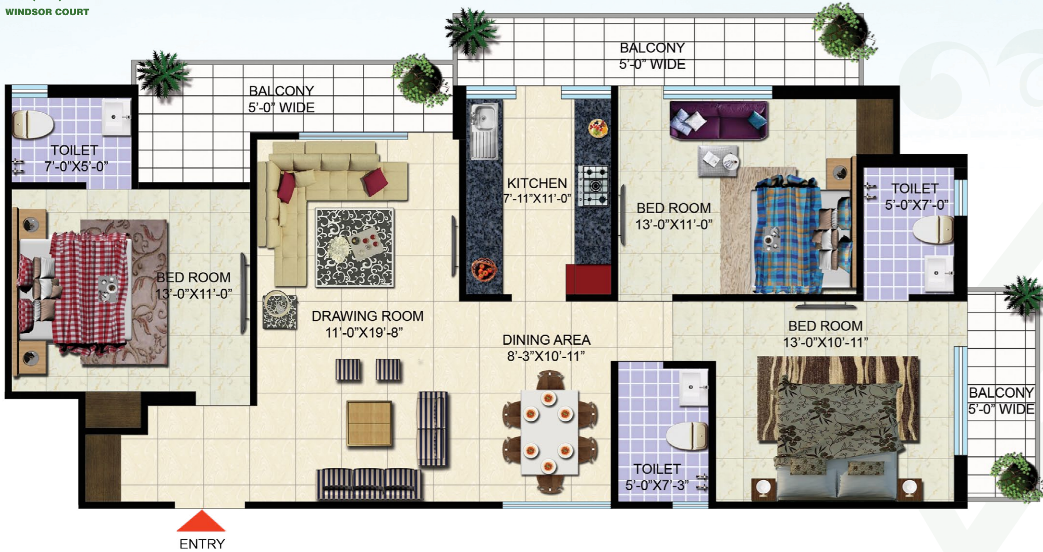
3 BHK + 3 TOILET + 3 BALCONY SUPER BUILT-UP AREA 1800 SQ. FT.