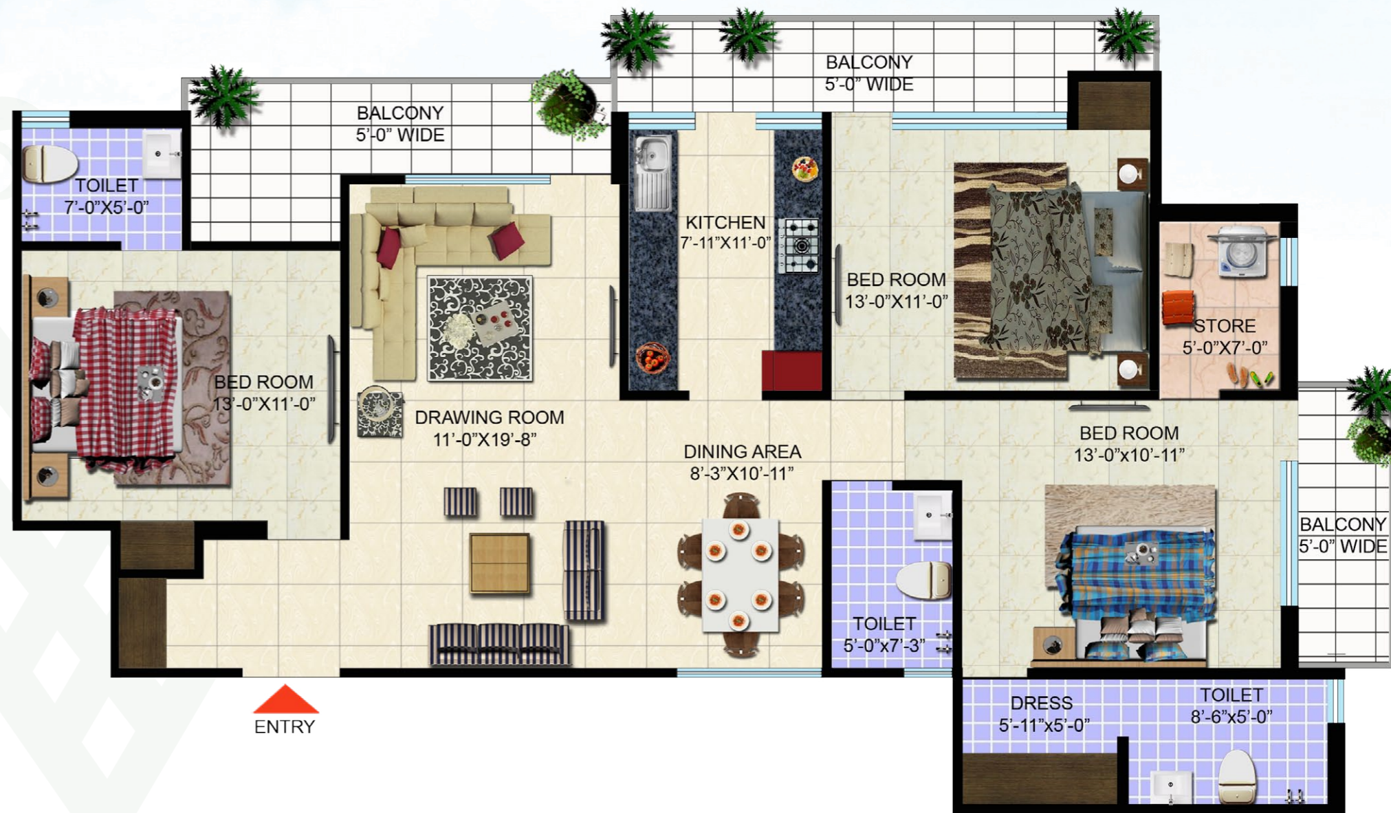
3 BHK + 3 TOILET + STORE + DRESS + 3 BALCONY SUPER BUILT-UP AREA 1875 SQ. FT.