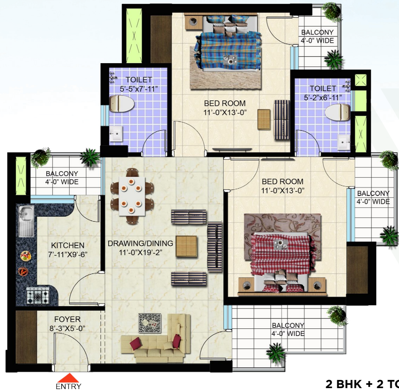
2 BHK + 2 TOILET + 4 BALCONY SUPER BUILT-UP AREA 1200 SQ. FT.