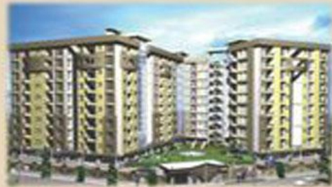
Surya Green GH -7, Sector - 10 A Vrindavan Yojna Raibareilly Road, Lucknow