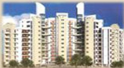
Surya Lake View G-1, Vikalp Khand-1, Gomti Nagar, Lucknow