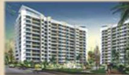
Surya Elegance Sector-1 Gomti Nagar Extn. Lucknow