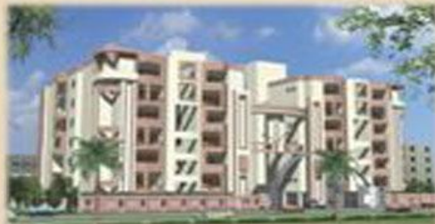
Surya Square 605/I, Vikalp Khand-4, Gomti Nagar, Lucknow