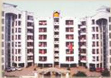
Surya Enclave Sector - 12 Munshi Pulia, Lucknow