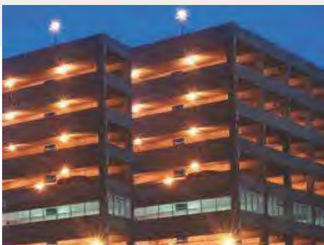
Commercial Complex Vivek Vihar, Delhi

Anthem Infrastructure welcomes you to become FRENCH APARTMENTS special & prestigious family.