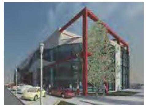
Commercial Complex Jaipur