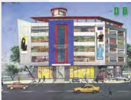
Commercial Complex Mayur Vihar, Delhi