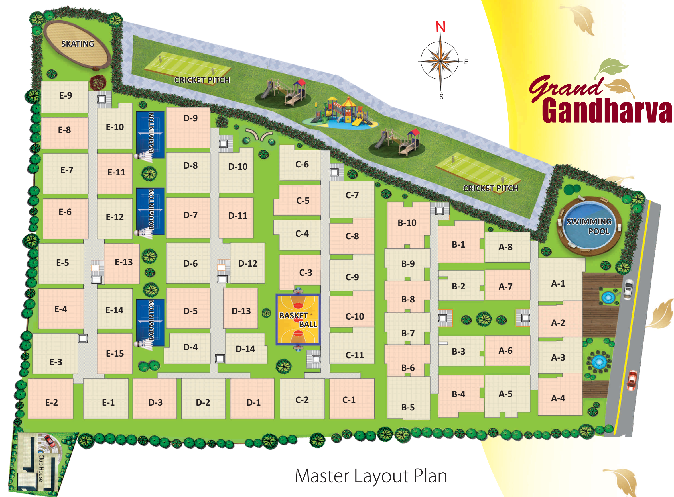
Master Layout Plan