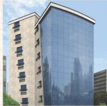
SWAROOP ARCADE ANDHERI(E), MUMBAI