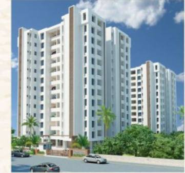
VASANT VIHAR RAJKOT, GUJARAT