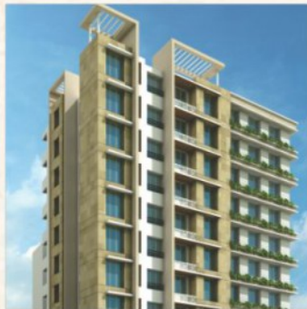
SWAROOP HARMONY SANTACRUZ (E), MUMBAI