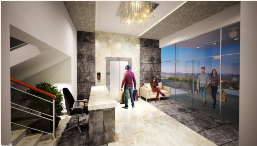
STATE OF THE ART ENTRANCE LOBBY

Comfortable, Airy, Well planned and a whole lot of worthy adjectives will come to mind when you step into your home.