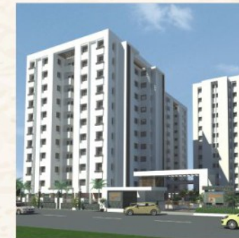
VASANT MARVEL RAJKOT, GUJARAT