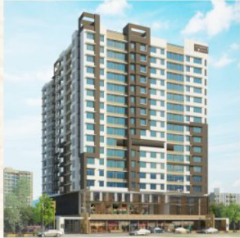
SWAROOP RESIDENCY GHATKOPAR (E), MUMBAI