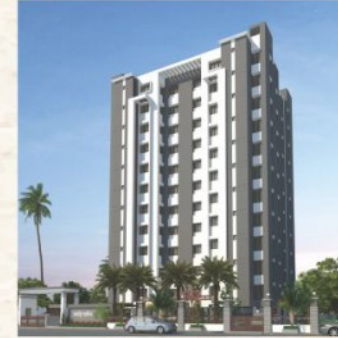
SAI DARSHAN RAJKOT, GUJARAT