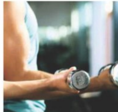
World Class Gym