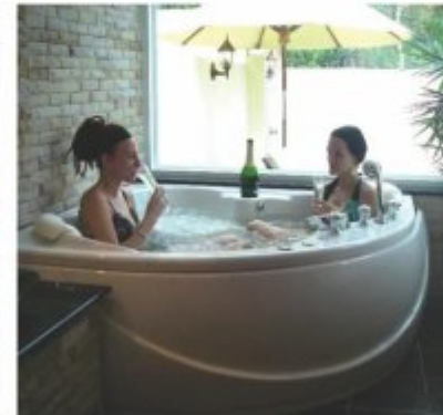
Jacuzzi and Sauna Bath

Enjoy every amenity within close proximity