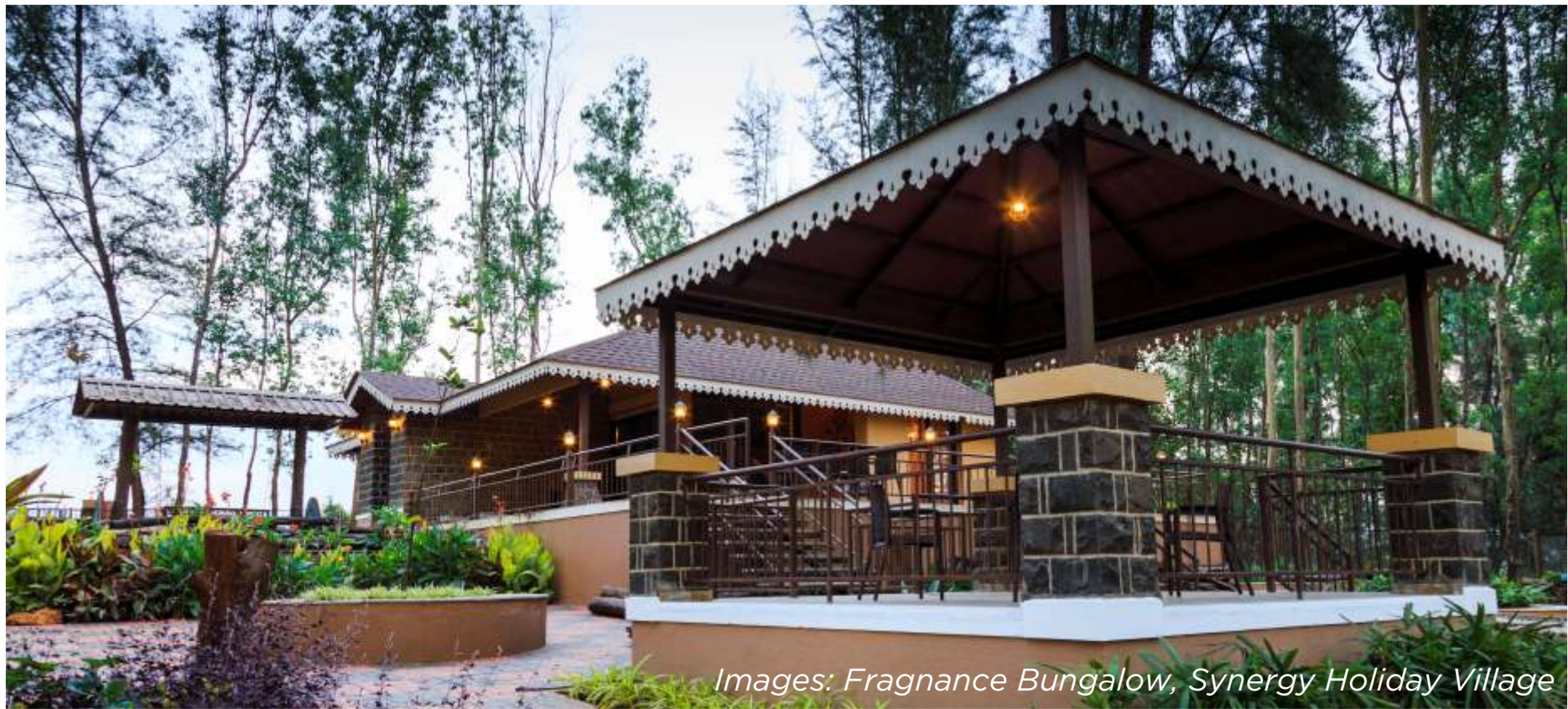
Images: Fragrance Bungalow, Synergy Holiday Village