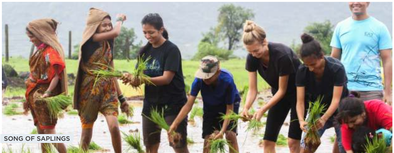
SONG OF SAPPLINGS