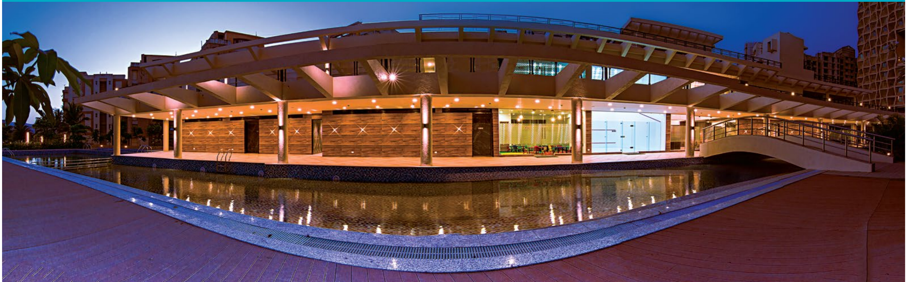
Actual Image of an Inimitable Podium Garden spread across massive 1.5 lakh sq.ft.