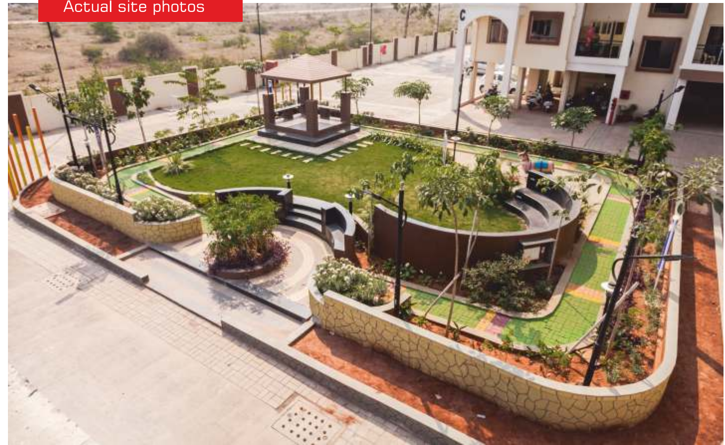
Actual site photos