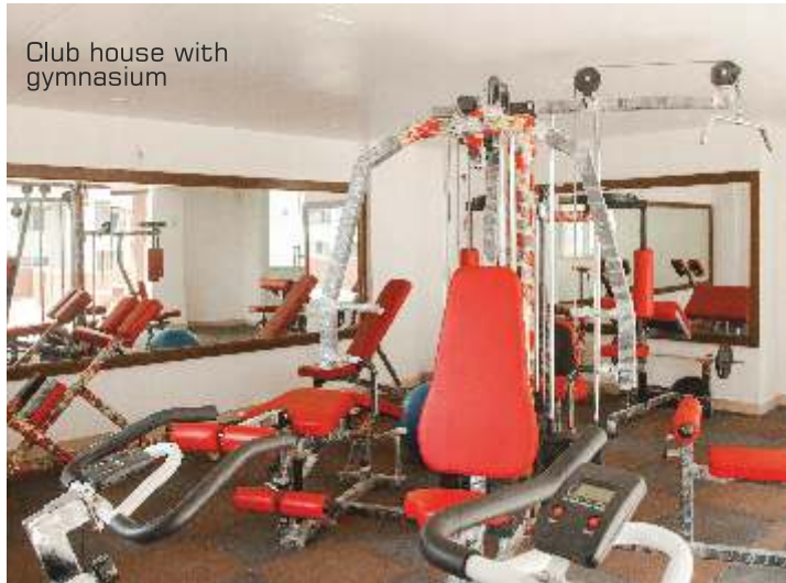
Club house with gymnasium