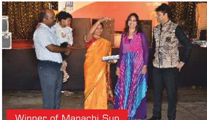
Winner of Manachi Sun