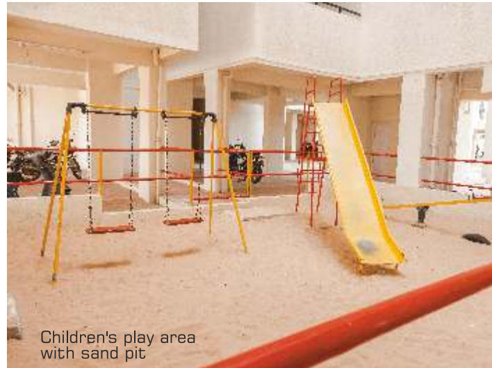
Children's play area with sand pit