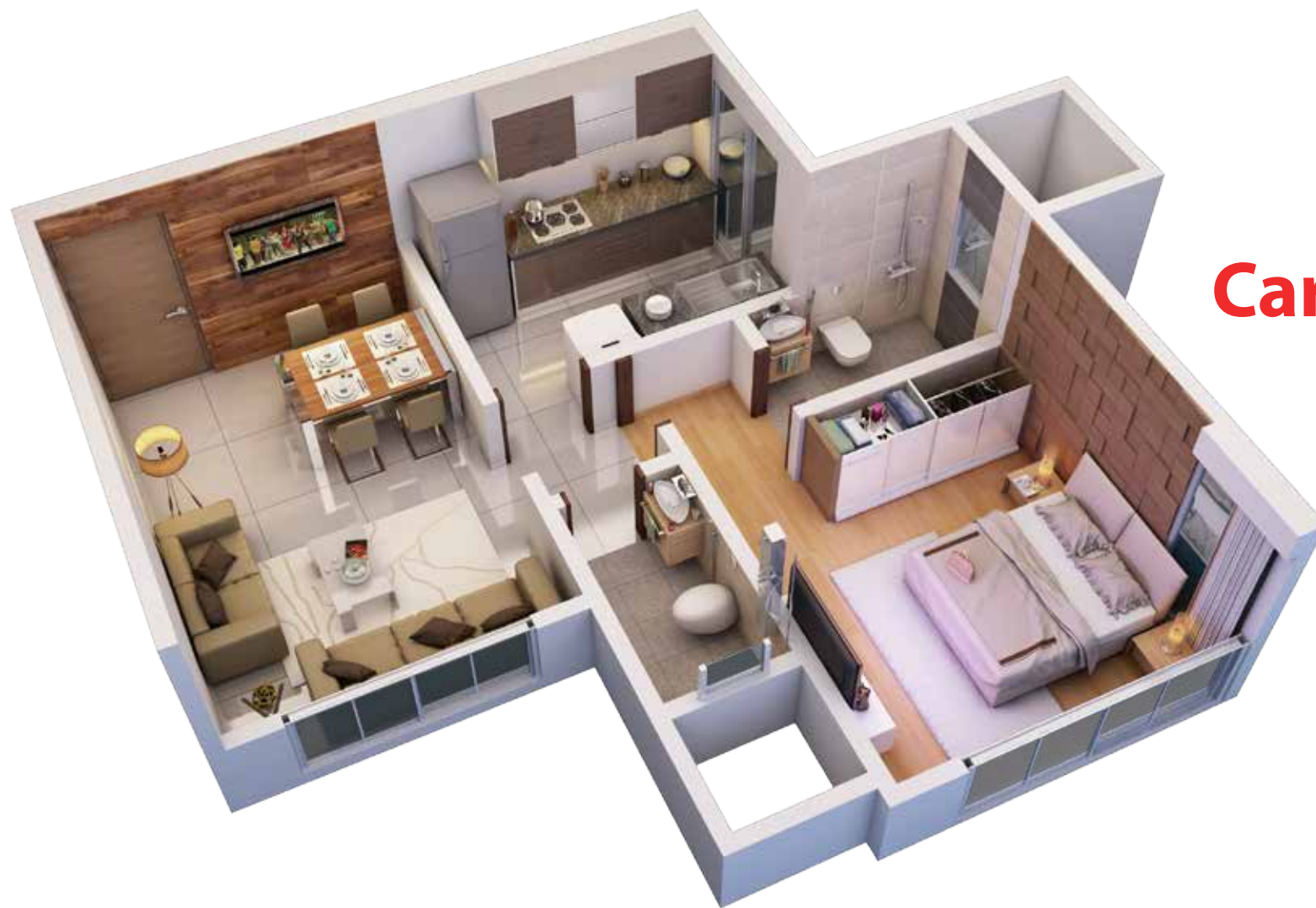
1 BHK Carpet Area 450 Sq. ft