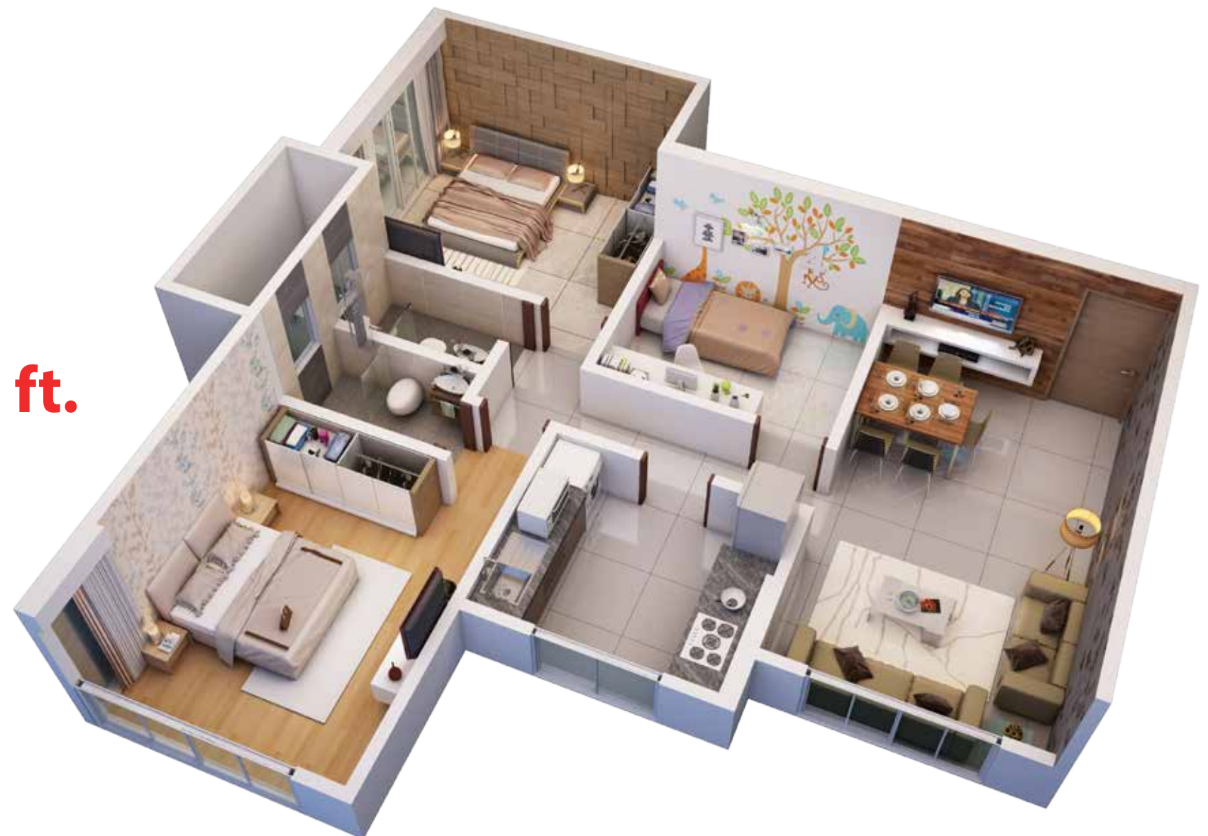
2 BHK Carpet Area 767 sq. ft.