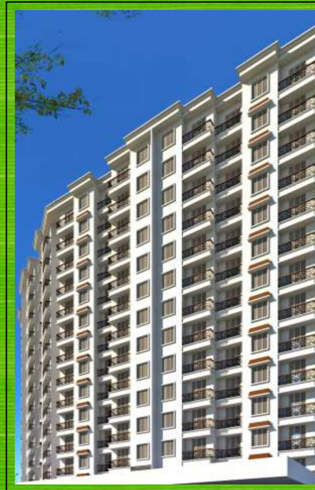
Falco Woodshire Ambivli, Kalyan