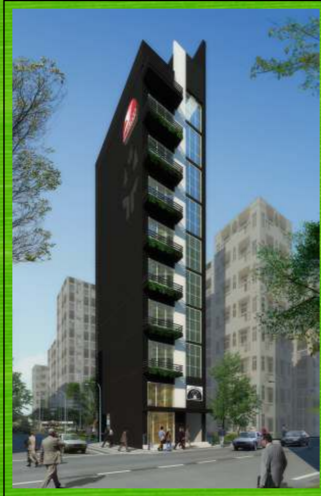
Falco Chambers Court Naka, Thane (W)