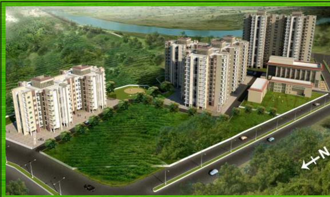
La Promenade Ambivli, Kalyan