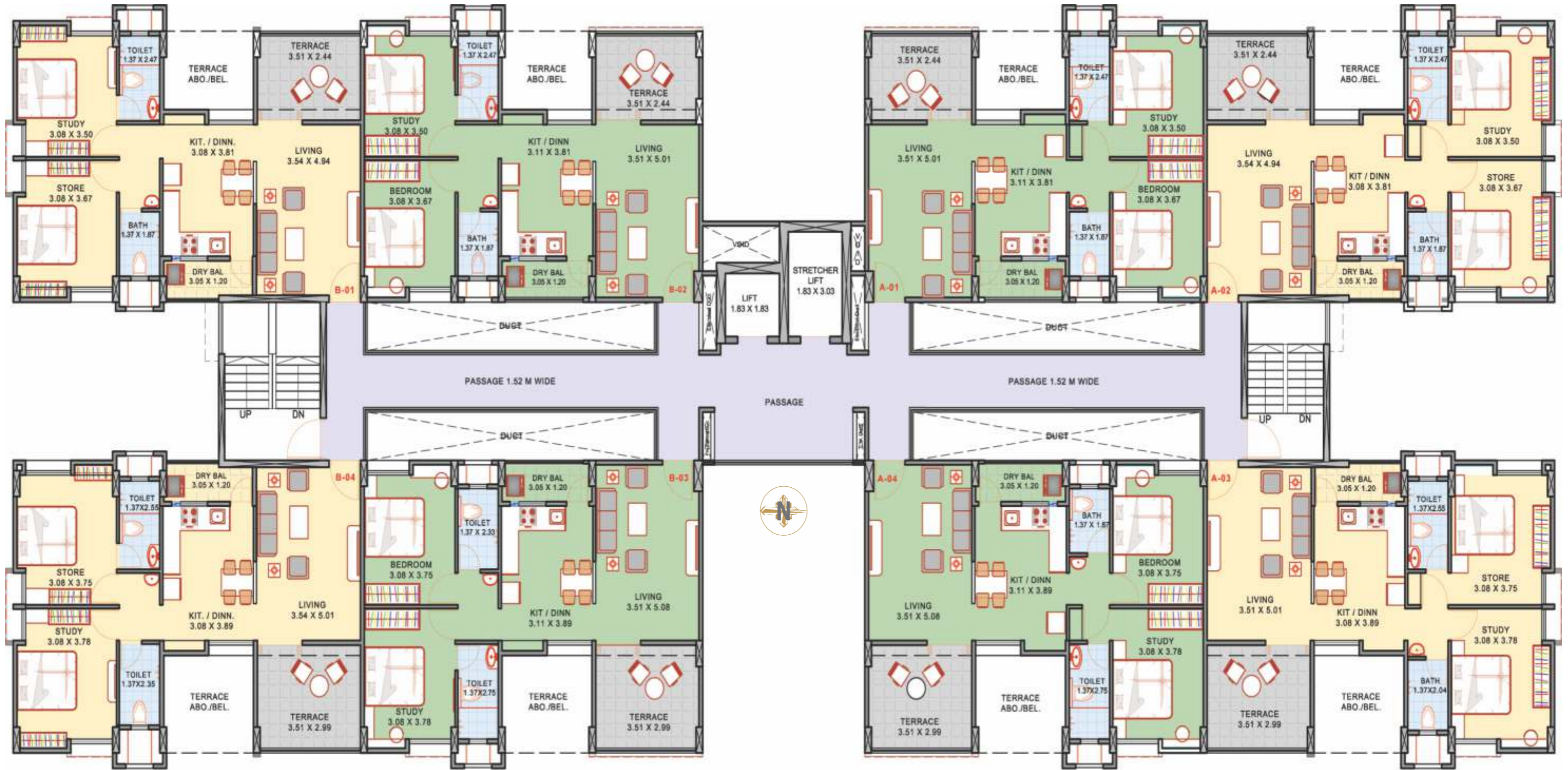
B - BUILDING