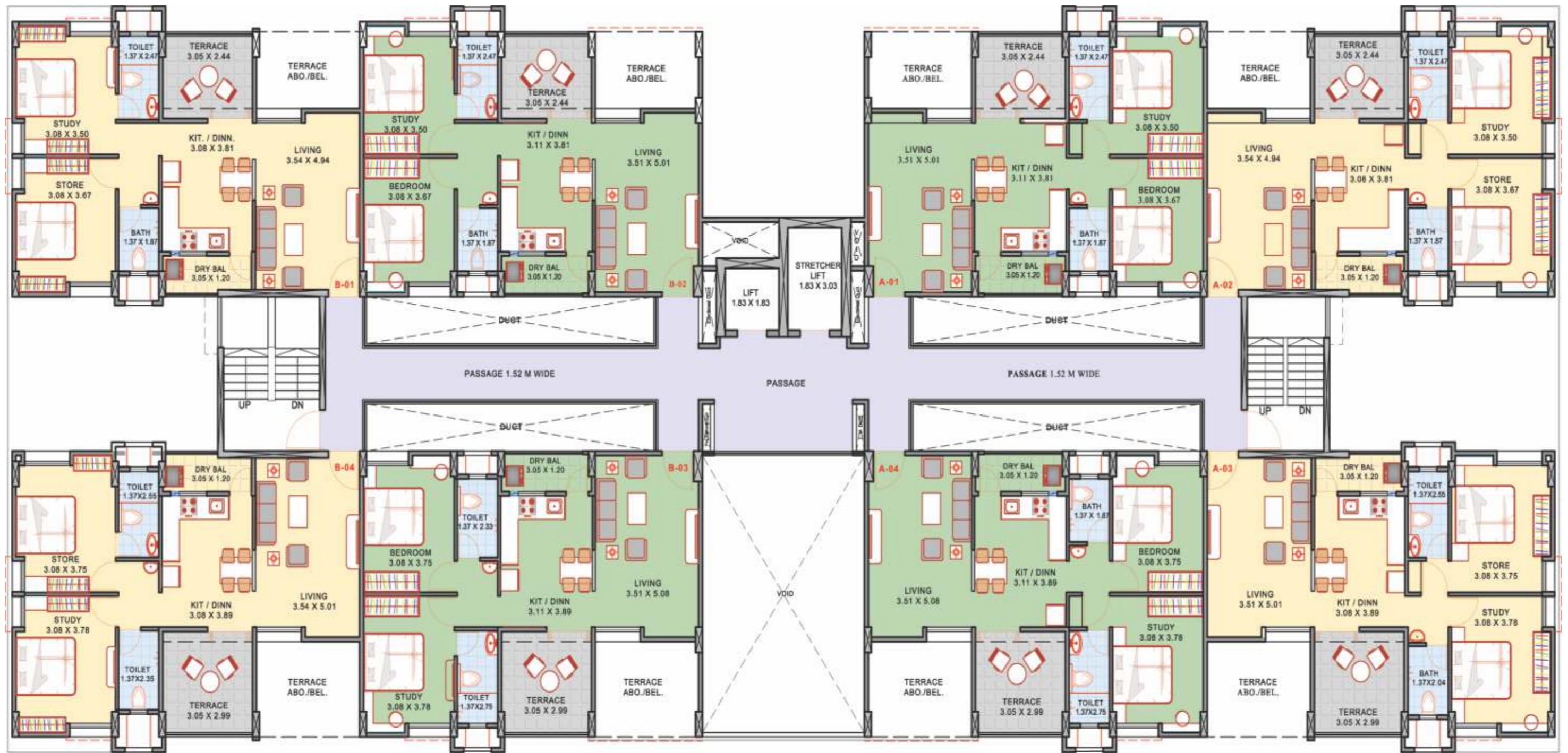
B - BUILDING