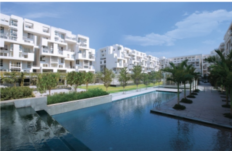
Rohan Mithila, Opposite Airport, Viman Nagar, Pune