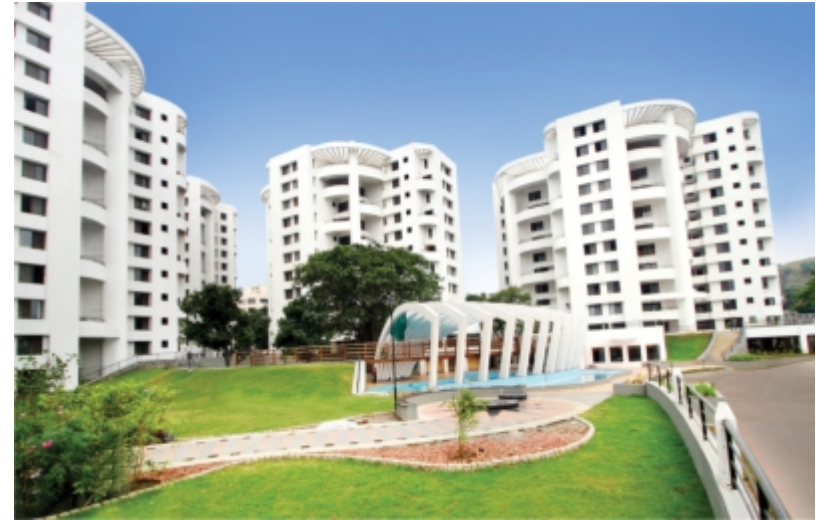
10 Kasturkunj, Bhosale Nagar, Pune