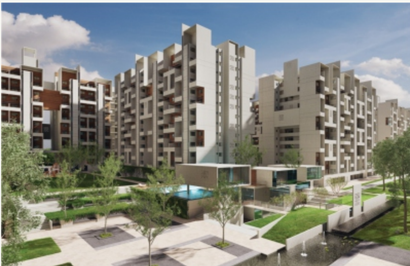
Rohan Abhilasha, Lohegaon Waghali Road, 7 Kms from Pune Airport