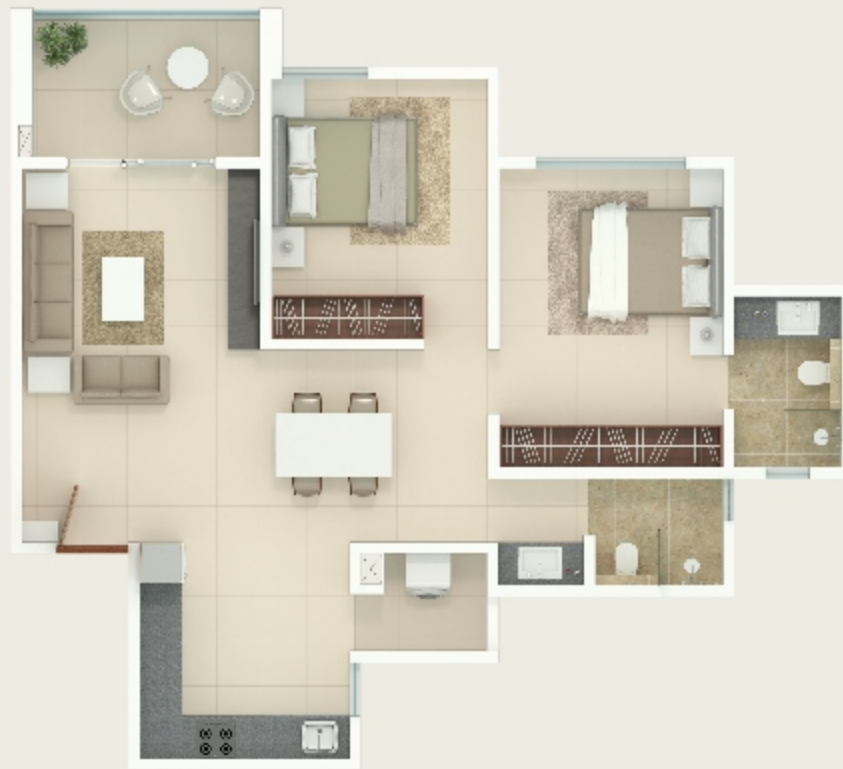
Typical 2 BHK