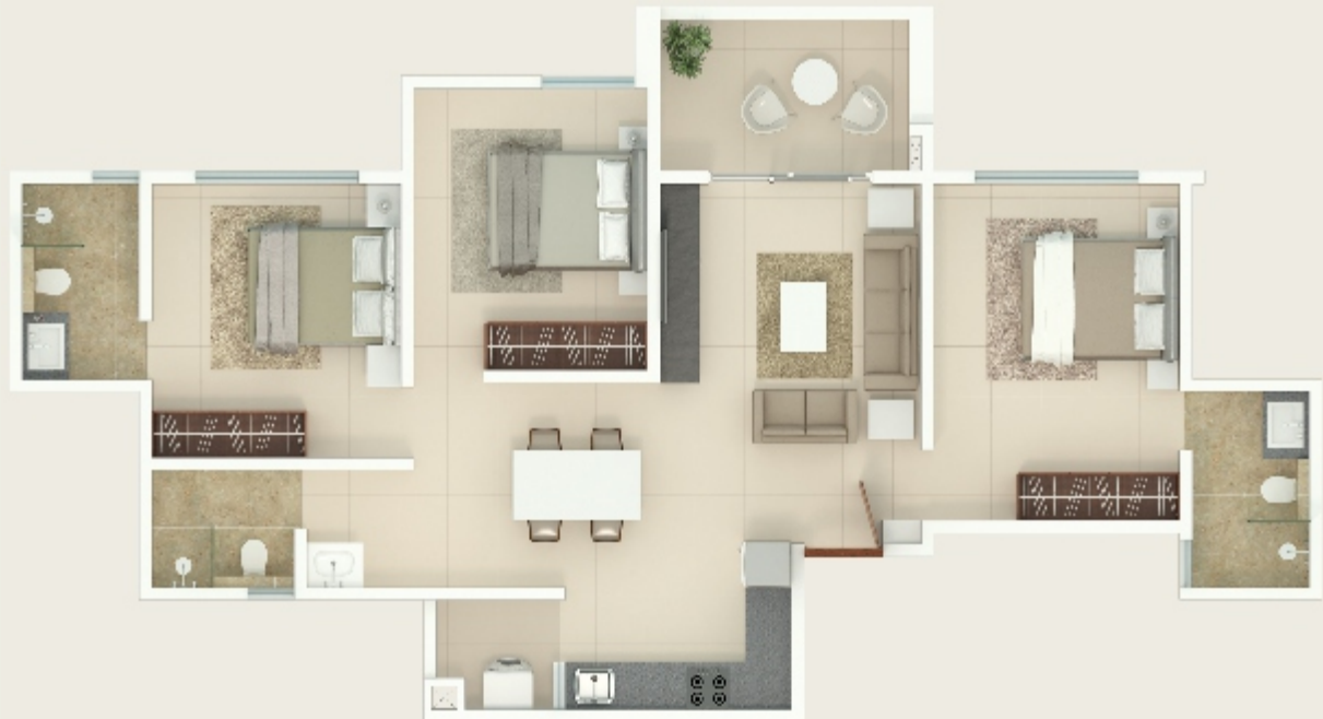
Typical 3 BHK