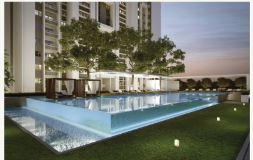
Rohan Akriti, Kanakapura Main Road, Bengaluru