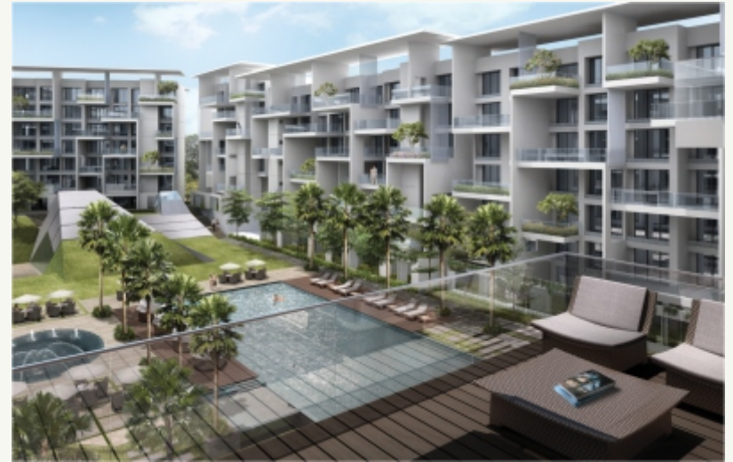
Rohan Kritika, Sinhadag Road, Pune