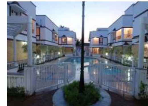
Chesterfields - Tudor Styled Architecture