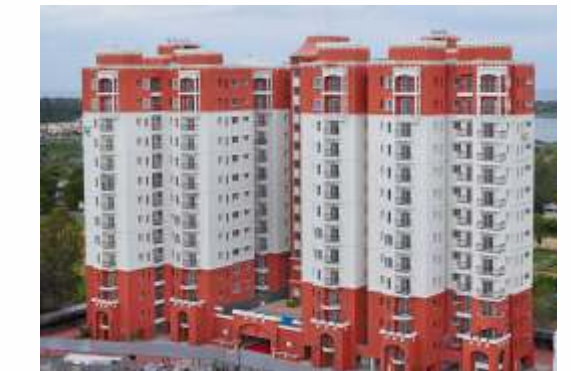
Siena - Tuscan Styled Architecture

Only developer in the country to deliver projects with 8 different Thematic Architecture.