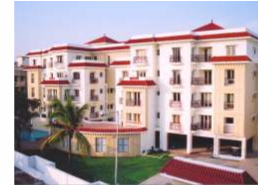
Villa Espana - Spanish Styled Architecture