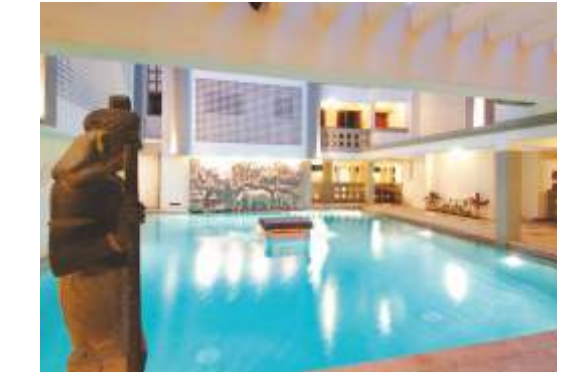
Pallava Heights - Pallava Styled Architecture