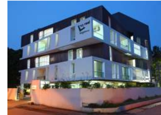
GreenEdge - Contemporary Styled Architecture

21 Years in the Industry | 3 Million Sft Delivered 6 Million Sft in the Pipeline | More than 1800 Happy Families