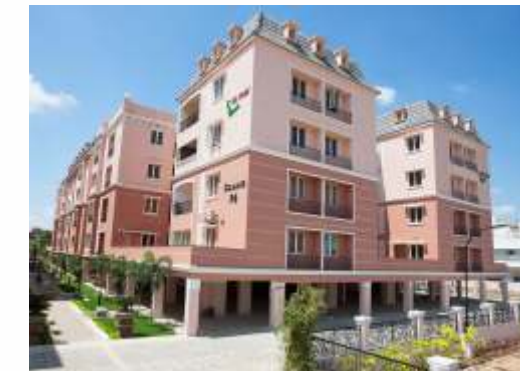
La Celeste - French Styled Architecture