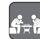
Indoor Games Facility