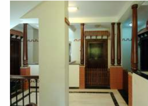
Prathyeka - Chettinad Styled Architecture