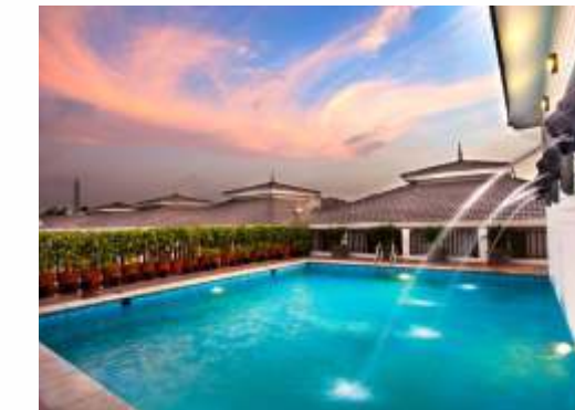
Villa Bali - Balinese Styled Architecture