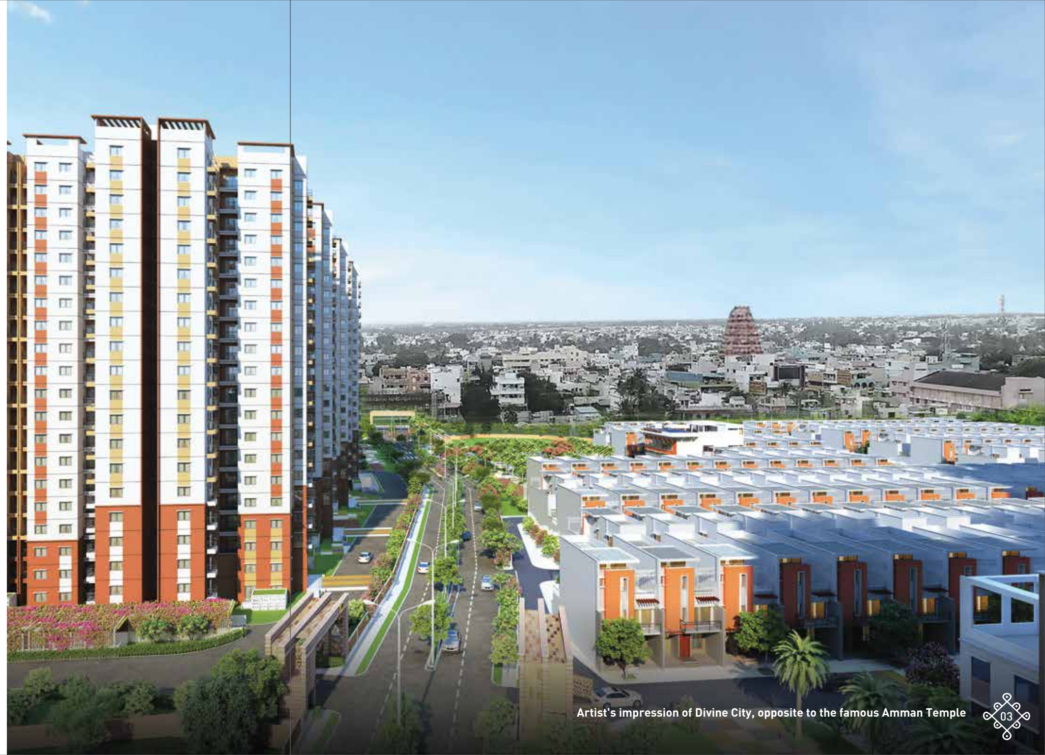
Artist's impression of Divine City, opposite to the famous Amman Temple

Now Mangadu will get it's second famous address.