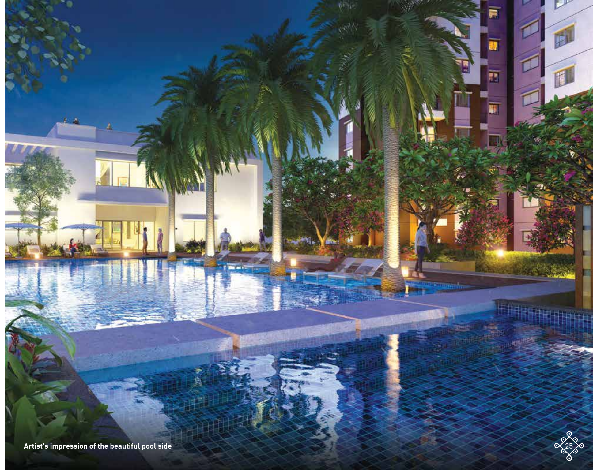
Artist's impression of the beautiful pool side