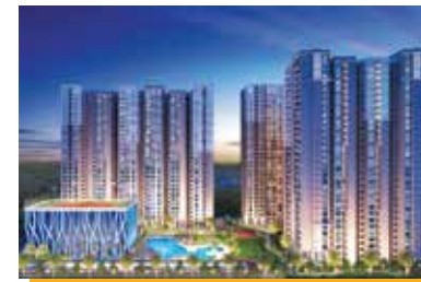
Marina Skies, Hyderabad

Track record of successful deliveries in high-rise residential and commercial real estate for the past 12 years