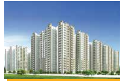
Rainbow Vistas @ Rock Garden, Hyderabad

Delivered 5 million sq.ft. of residential living spaces