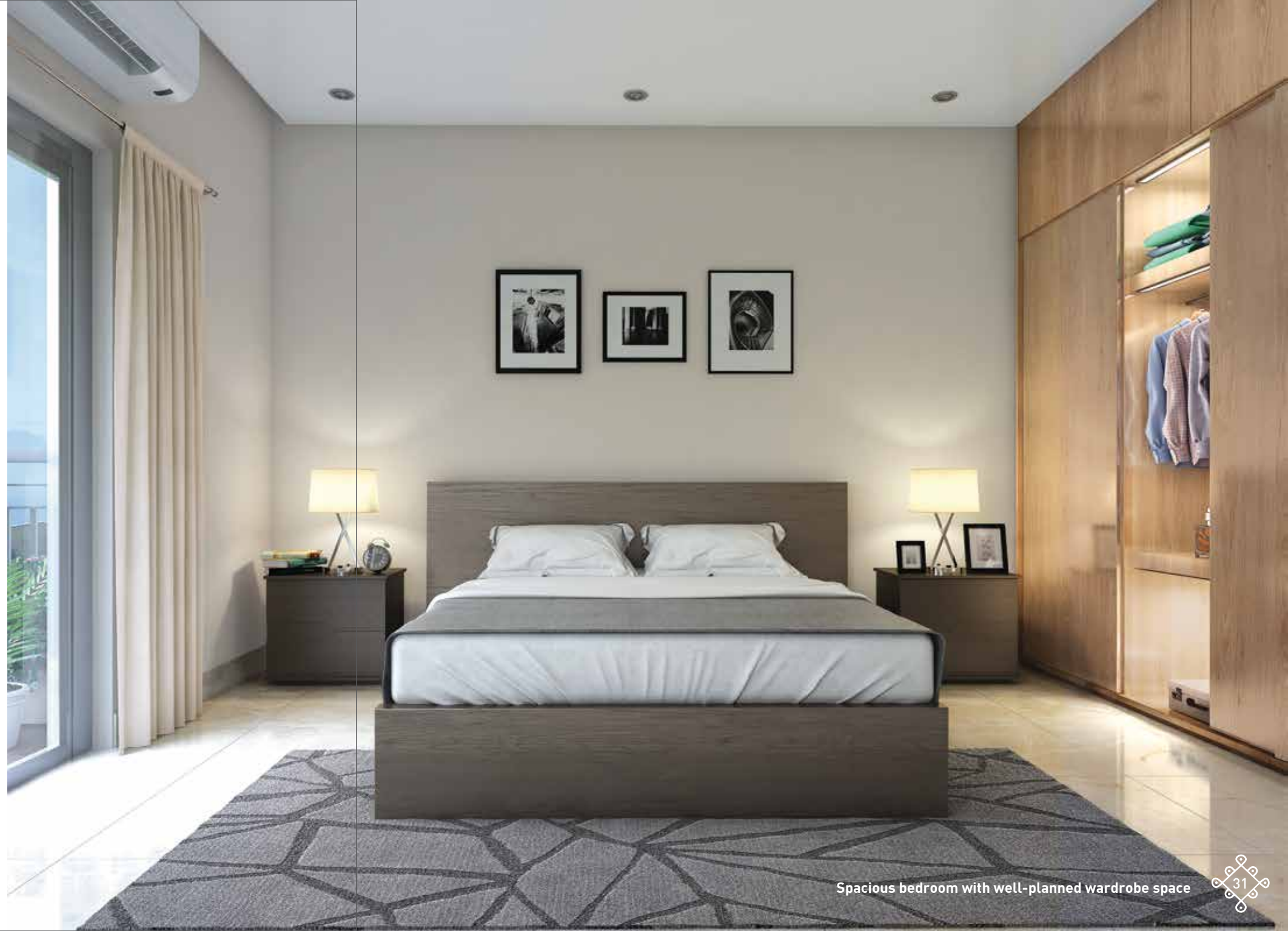
Spacious bedroom with well-planned wardrobe space